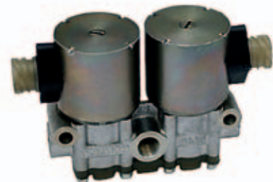
Electropneumatic Valve 14.3745010