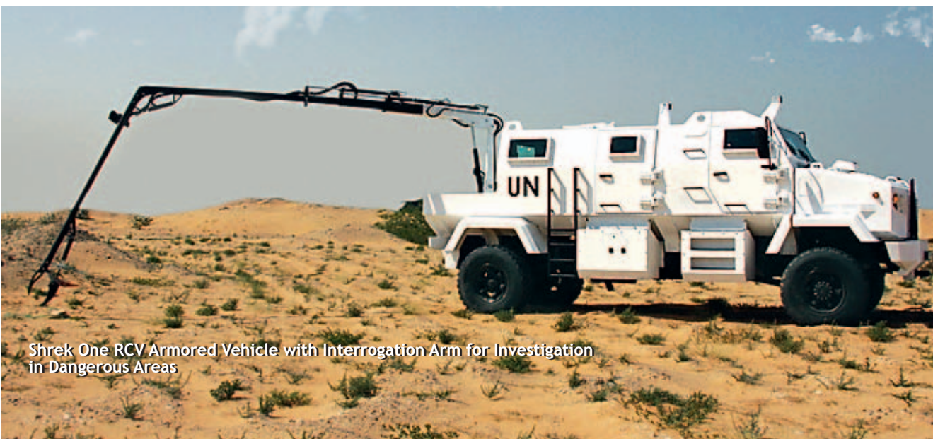
Shrek One RCV Armored Vehicle with Interrogation Arm for Investigation in Dangerous Areas

We believe that “KrAZ”-Streit partnership has good prospects for development through defense and law enforcement agencies using our vehicles for safe transportation of personnel, patrolling, escorting and peace-keeping tasks. I am sure that “KrAZ”-Streit tandem will have great global success.