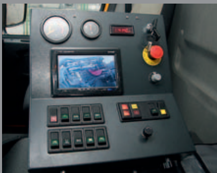
Sweeping equipment control board has display showing images from camera located on the right side of the vehicle