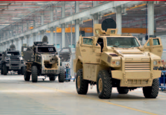
Main Assembly Line of Streit Group

Streit Manufacturing Inc. was founded almost 20 years ago in Ontario (Canada). We started manufacturing armored vehicles in rented garage with few tools and bank loan, our first contract awarded was for delivery of three armored wagons. My dream was to manufacture the most innovative and safe vehicles. We worked non-stop to build vehicles before scheduled date. By the way, those wagons hand assembled by Streit workers are still in operation, although used as reserve vehicles.