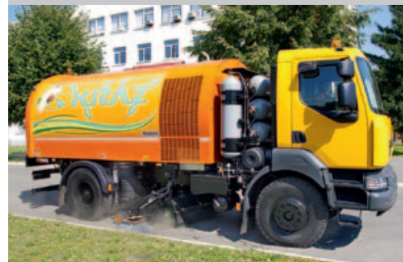
The KrAZ-5401K2 Vacuum Street Sweeper with the Daimler Engine