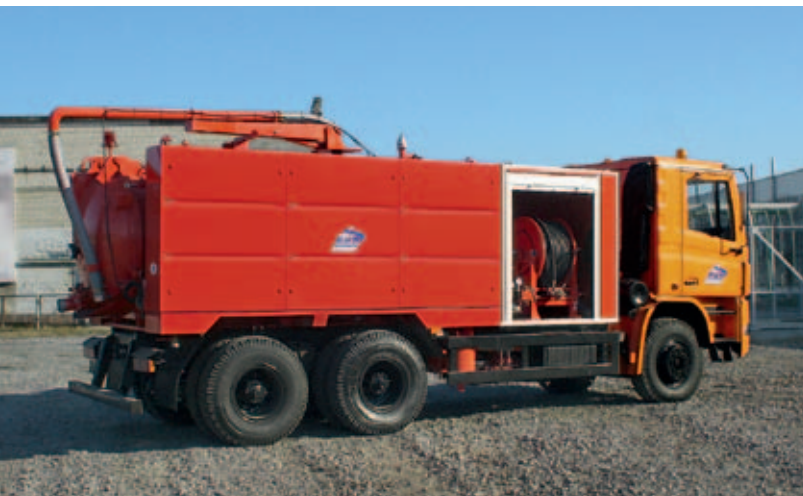
The KO-503 IVK Vacuum Vehicle Mounted on the KrAZ H12.2 Chassis Cab