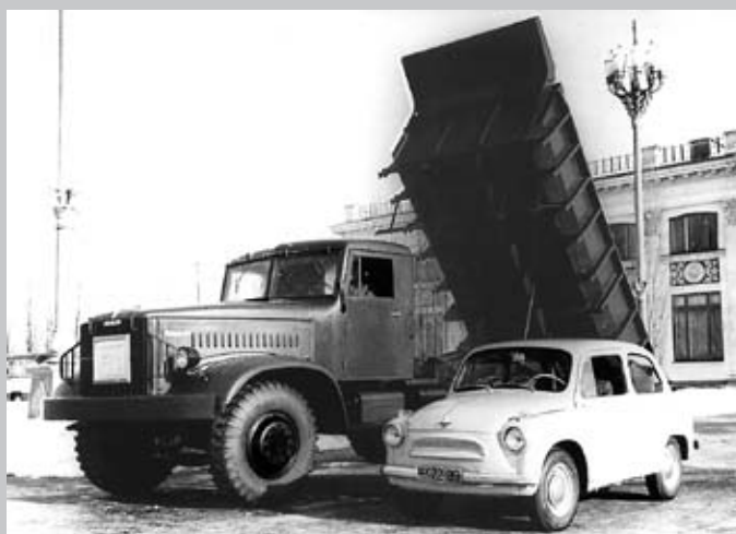
First-Borns of the Ukrainian Automotive Industry: the KrAZ-222 truck and the ZAZ-965 Zaporozhets at USSR EANE, 1960.