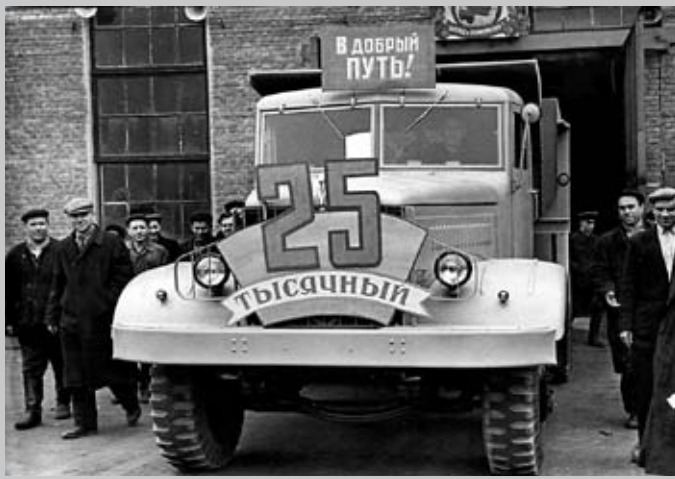
25000th KrAZ-222 Truck. April 16, 1963.