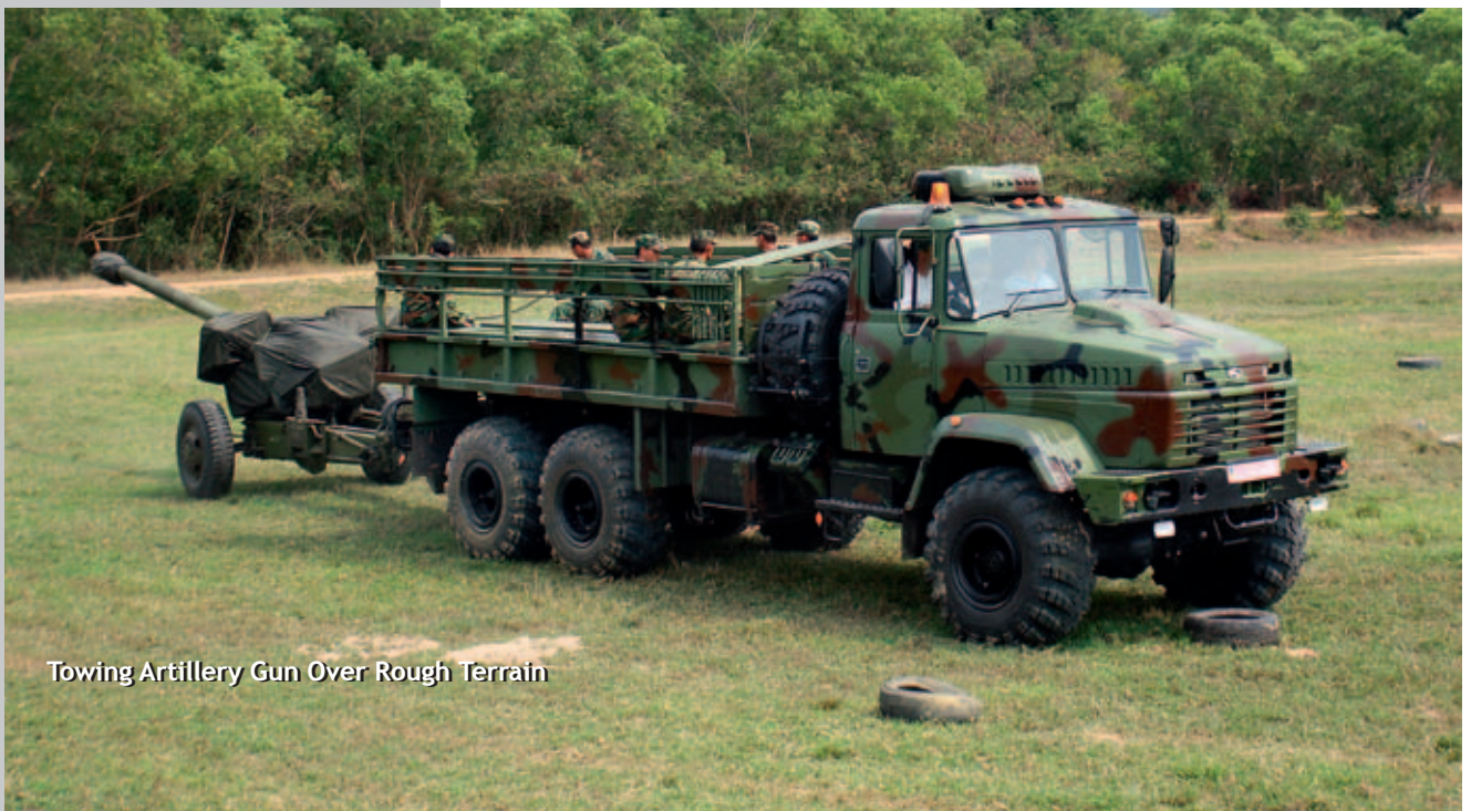
Towing Artillery Gun Over Rough Terrain

16.01. I can say that KrAZ testing has already started. The truck went under its own power to Kanchanaburi province (300 km) as tractor truck with semitrailer that had to haul it to test site had not been