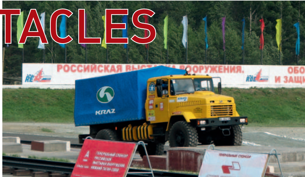
The KrAZ-5233Be Truck Drives over Vertical Step. Nizhniy Tagil, 2007.