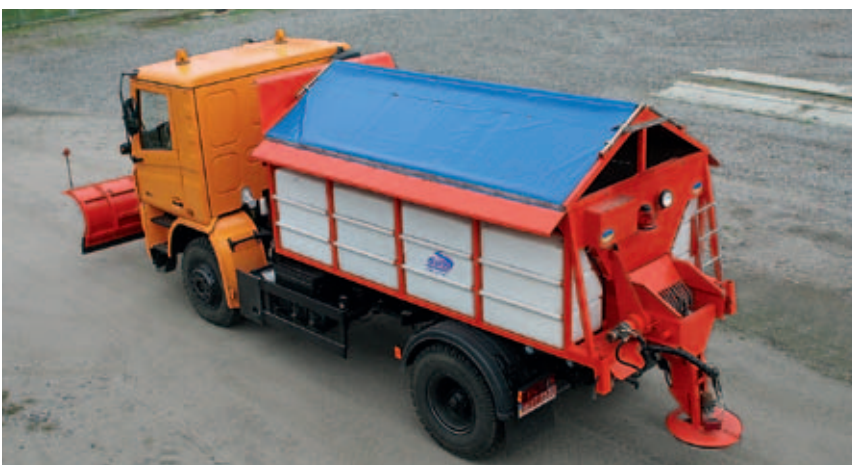
The KrAZ H12.2 MDKZ Truck with “Budshlyakhmash” Sand Spreading and Snow Removal Equipment