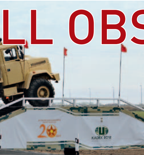
ing Ground. Kazakhstan, 2012.