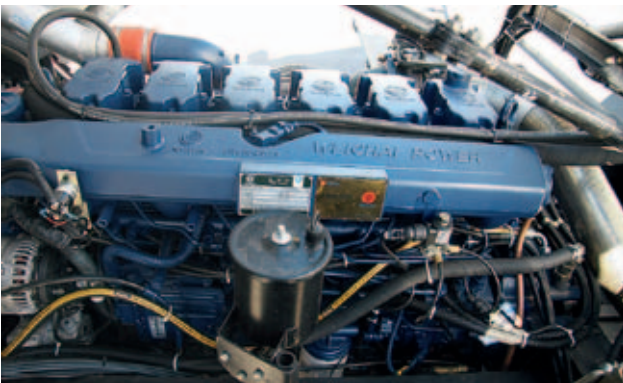
The WP12.400E40 Inline Engine Rated at 400 hp.