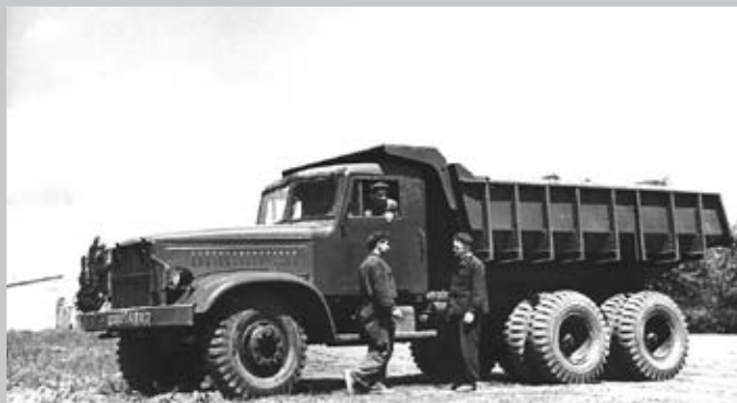
Running In of the KrAZ-222. May, 1959.

The history of trademark for the new automotive brand “KrAZ” is not without interest. Conditions of a contest announced in November stipulated the design of the tiniest parts of this trademark. It should be not only decorative element but also serve as bonnet handle and fit exactly into the space provided for Yaroslavl Automobile Plant trademark replacing a bear on the bonnet and plate YaAZ on radiator grille. A commission selected an acronym KrAZ among several versions of logo submitted to the Chief Designer Department. There were propositions to name a new plant and vehicle UAZ (Ukrainian Automobile Plant), KAZ (Kremenchug Automobile Plant), Dniepr, etc.