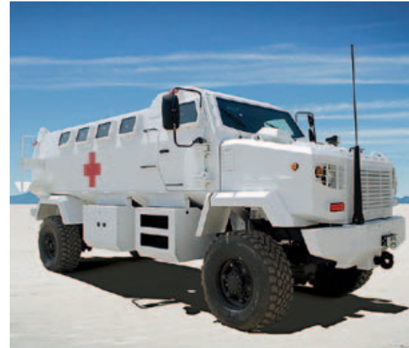
Shrek One Armored Ambulance Mounted on the KrAZ-5133HE

and acceptable operating costs. Surely, one of the most important criteria was its excellent value-for-money ratio.