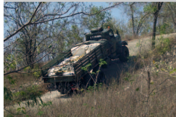
Driving Up 64 Percent Slope