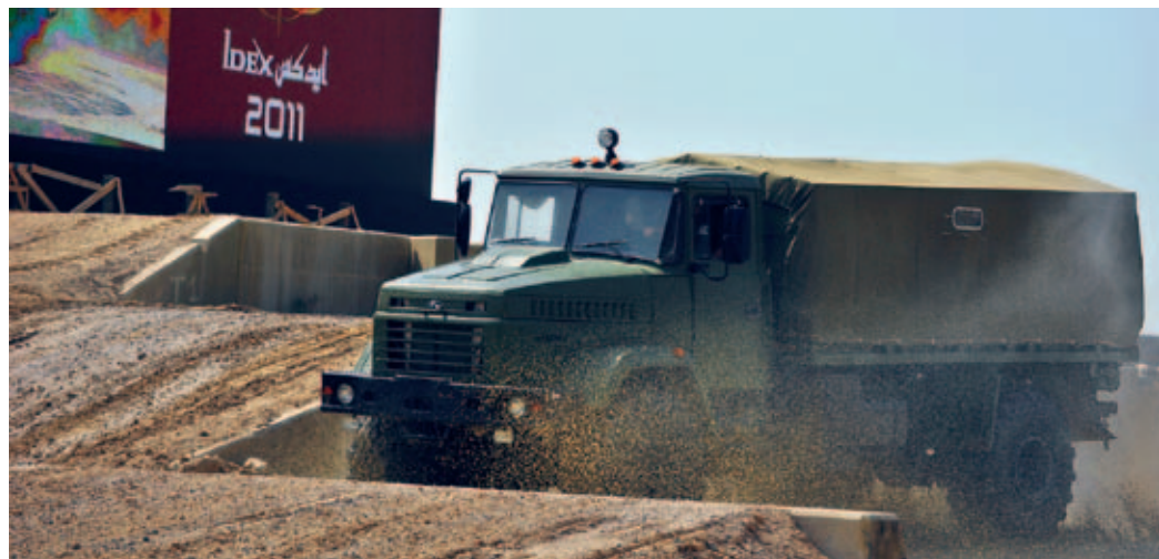
The KrAZ-5233BE Truck Driven over Cross-Country Courses at IDEX-2011.