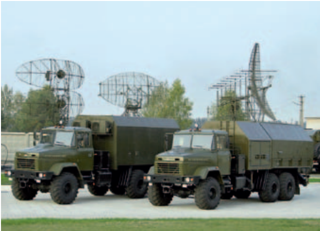
The KrAZ-6322REB-Mounted Kolchuga-M Passive Surveillance System