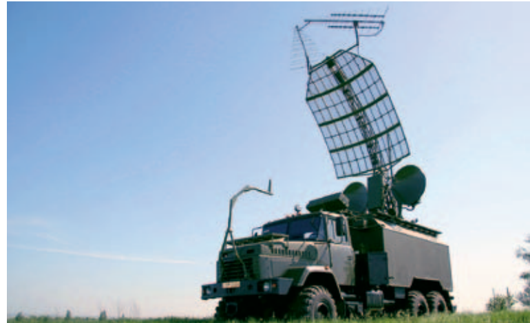
The KrAZ-6322REB-Mounted Kolchuga-M Passive Surveillance System

emerged for armoured trucks, for this reason, “AutoKrAZ” and its partners started building vehicles provided with base and additional armour kits.