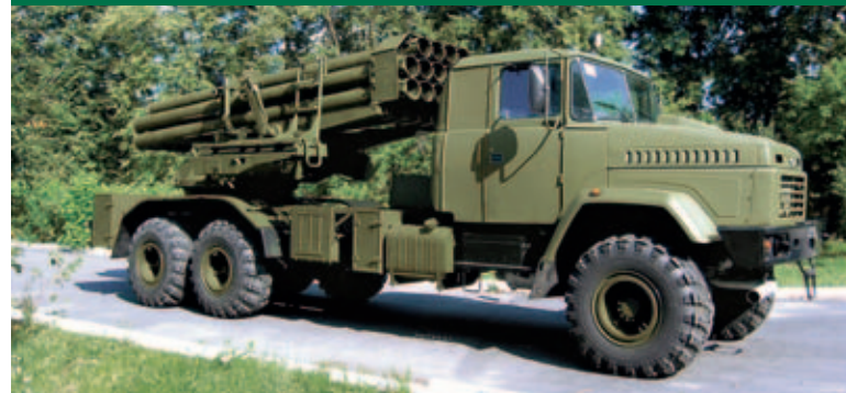
The 9K57 Uragan Weapons System