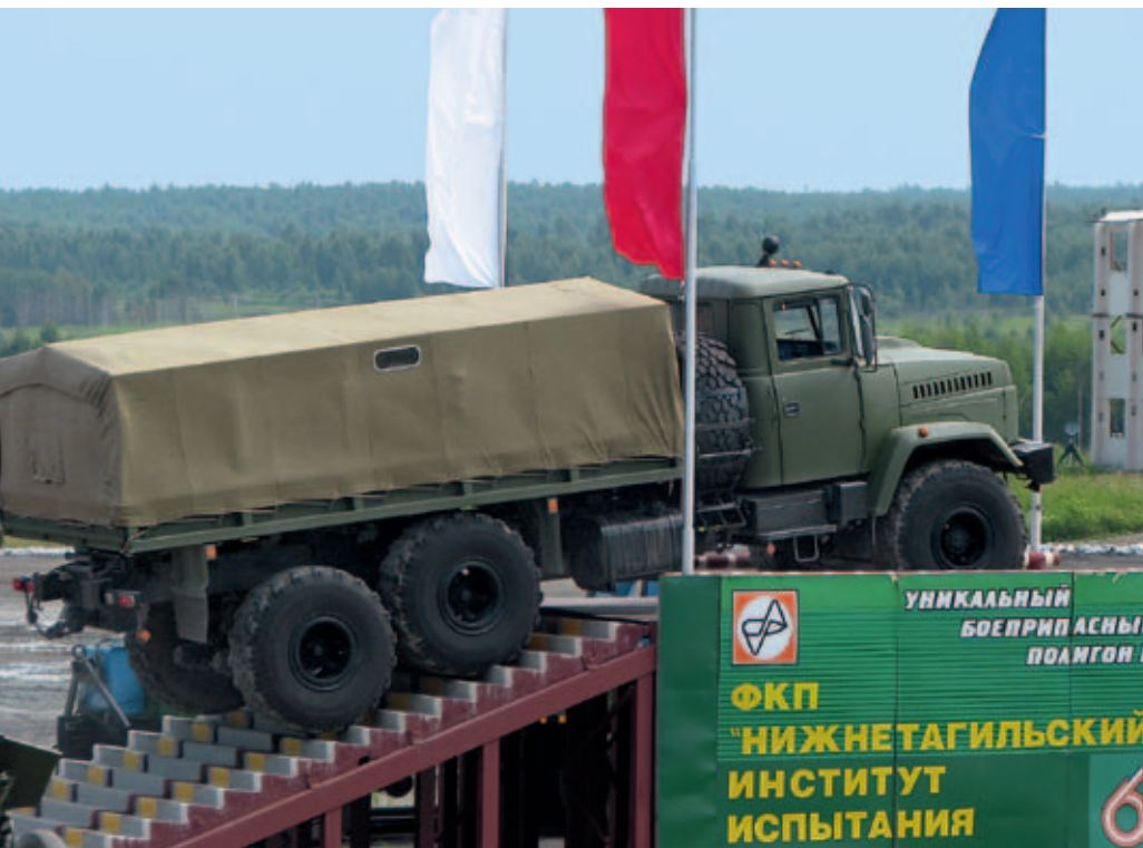
The KrAZ-5233BE Truck on Steps. Nizhniy Tagil, 2010.

KrAZ has been rightly called off-road vehicle. There is no obstacle KrAZ truck cannot overcome. Proving ground obstacles are no exception.