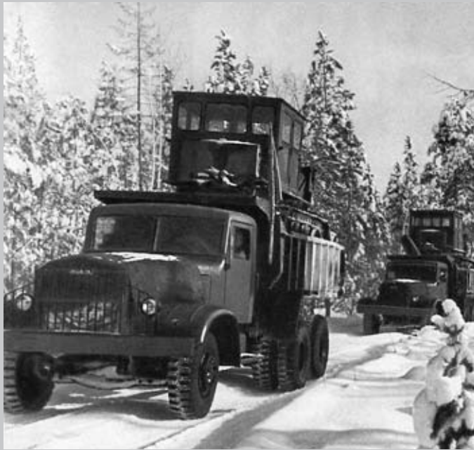
The KrAZ-222 Truck is Used to Haul Earth-Mover. 1963.