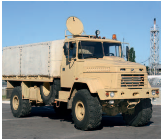
The KrAZ-5233 Spetsnaz Truck