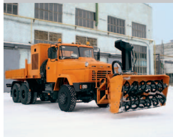
The KrAZ-63221 Road Maintenance Vehicle with RETECH Snow Cutter Blower