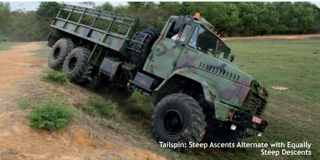
Tailspin: Steep Ascents Alternate with Equally Steep Descents