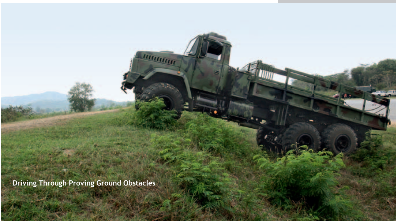
Driving Through Proving Ground Obstacles