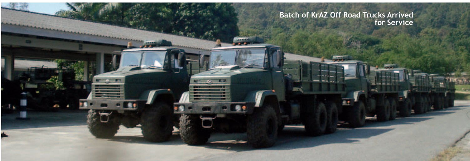
Batch of KrAZ Off Road Trucks Arrived for Service

Information: the above-described events led to awarding the contract for delivery of 86 KrAZ off road trucks to the Royal Thai Army. The contract has been performed: KrAZ trucks have been in service with the army.