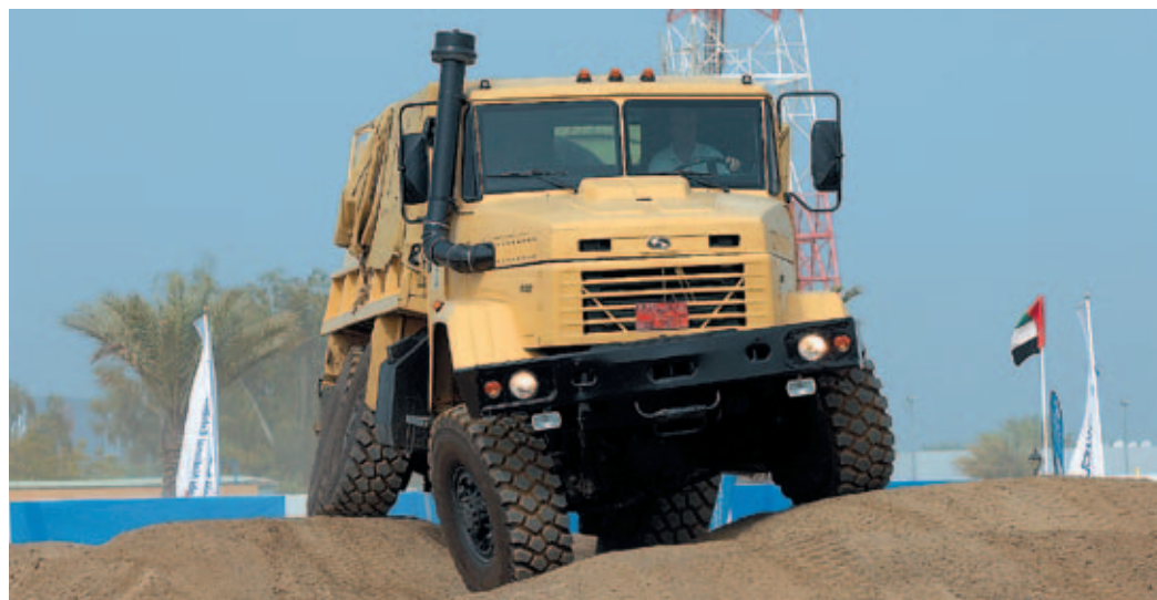
The KrAZ-6322 Raptor Overcomes Bumpy Track. UAE, IDEX-2007.