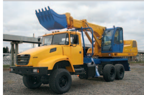
The UDS-114 Boom Excavator Mounted on the KrAZ H17.1EX Chassis