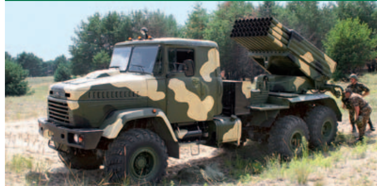
Based on the KrAZ-63221 Chassis Truck

KrAZ is waiting for call up! Alone or in partnership with such national manufacturers as “Iskra”, “Aerotechnika”, “Progress” and “KhZTO”, KrAZ is willing to provide the Ukrainian army with state-of-the-art weapons and military equipment. Hope emerged that governmental policy aimed to support domestic manufacturers would be put into reality. We would like economic patriotism of Japan and USA to set the example for Ukraine. Their cry Be a Patriot, Buy Domestic Products could not have come at a better time. House divided against itself cannot stand! Serve to the people of Ukraine!