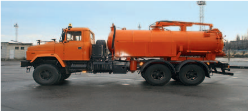
The KrAZ-6322 (KO-503IV) Sludge Pumping Vehicle Provided with Equipment from “Budshlyakhmash”

vehicles, multi-purpose road maintenance trucks. The first municipal vehicles of this lineup went to serve to community to Kiev, Donetsk, Kremenchug and Komsomolsk. Manufacturer’s fears over difficult assimilation of heavy-duty truck in alien urban environment have not panned out. Moreover, its performance characteristics greatly exceed designed ones. Operators’ opinion: KrAZ does well in urban cycle, it offers efficiency, mobility and high performance.