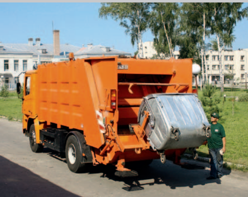
The KrAZ K12.2 Rear Loader Garbage Truck

It is hard to imagine maintenance of urban streets without using special vehicles. Cleaning of storm drains, response to disasters, water supply to residents and urban infrastructure maintenance are hardly possible without special equipment for municipal services. Domestic manufacturer “AutoKrAZ” has all the capabilities to provide municipal services of the country with high-performance and efficient vehicles.