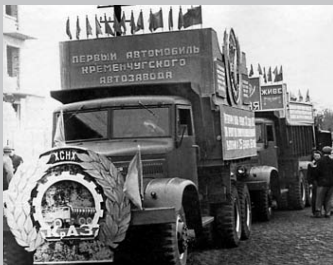
The First KrAZ-222 Dniepr Dump Trucks at May Day Parade in Kremenchug, 1959.