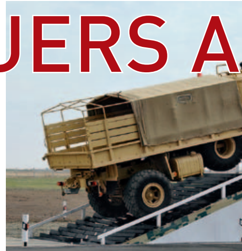
The KrAZ-5233 Spetsnaz Truck at Kadex Proving Ground, 2010.