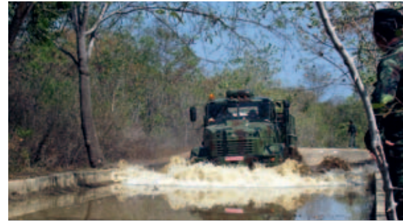
Wading Pond Negotiated!

When driving through obstacles our skilled driver from habit beat the bag out of it. He knew full surely, KrAZ is able to withstand extreme challenges. He suddenly recalled triumph in 2006 at IDEX demonstration track in Abu Dhabi, when KrAZ, this armoured leviathan, successfully overcame obstacles one by one. Then brilliant driving up 70 percent hill on the military proving ground in RSA. Sheikhs, generals, government leaders gave standing ovation to the KrAZ truck. He will show here in Thailand that KrAZ is an excellent truck, worthy adversary that must be respected. Simple and tough design, perfect strength and stability, ability to get out of any trouble, easy maintenance made this truck a must in many