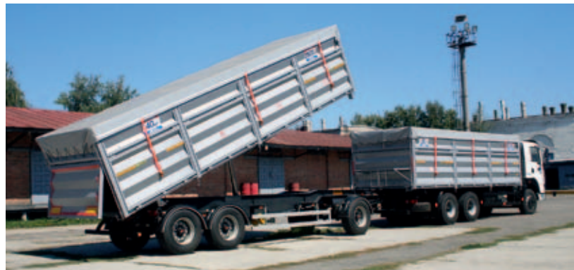
Trailer Dump Body Capable to Tip the Right and to the Rear