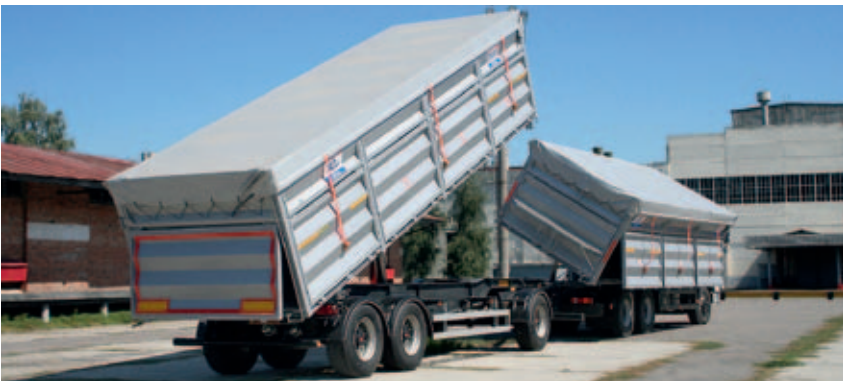
Dumping to the Rear and Right Side