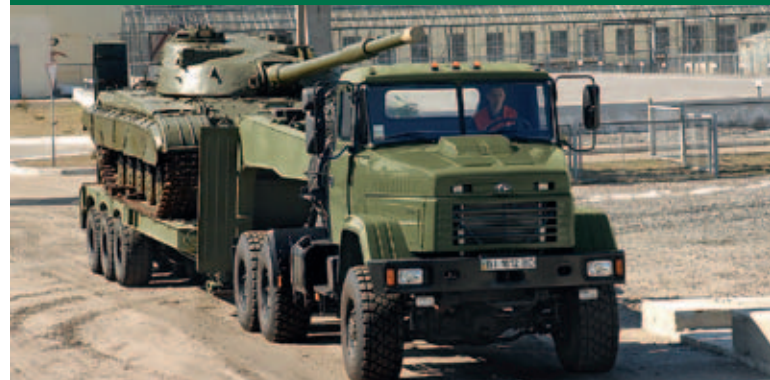
The KrAZ T17.1EX Tractor Truck in Combination with Trailer