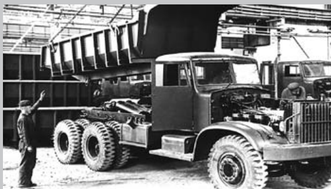
Installation of Dump Body on the KrAZ-222 Truck in Assembly Shop. 1960.