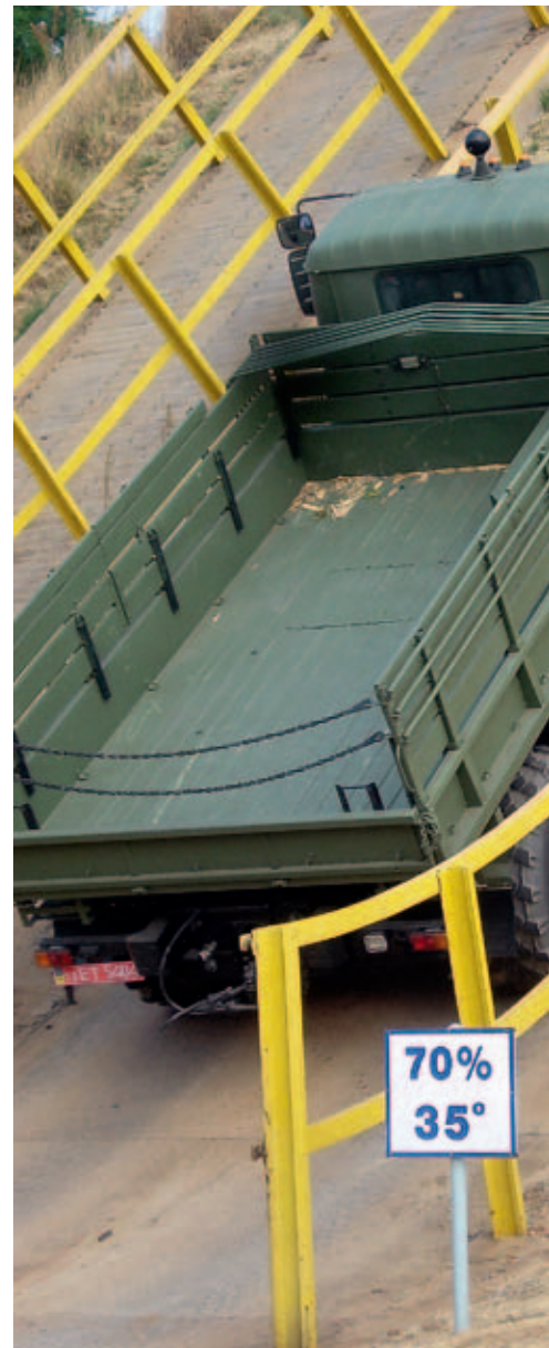
The KrAZ-5233 Truck is the Only Vehicle that space & Defence. RSA, 2010.

is an audacious dazzling show featuring special boldness. Overcoming seemingly the most challenging obstacles of proving grounds it is a breeze for KrAZ. A flight off jump, driving up and down a 70 percent hill, spectacular driving through wading pool and mud pit is a risk, extreme, and KrAZ is at home in it.