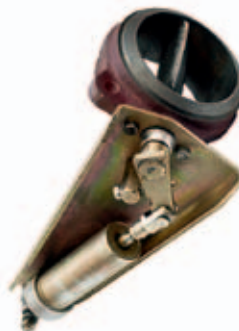
Auxiliary Brake 12.3570010