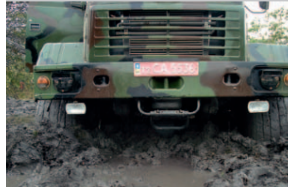
KrAZ Trucks Are Not Afraid of Mud