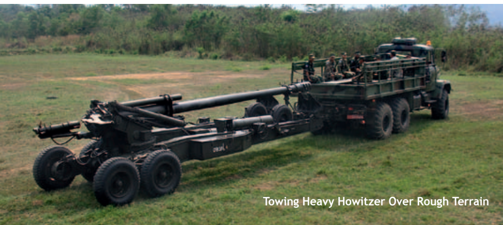
Towing Heavy Howitzer Over Rough Terrain