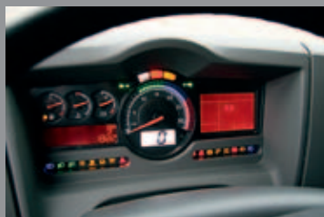
Tachometer with LED scale and digital speedometer in the centre of control panel