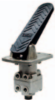
Brake Valve and Pedal 121.3543081

We've got loads of plans for this year! We are not going to slow down, our team is committed to fulfill approved business-plan.