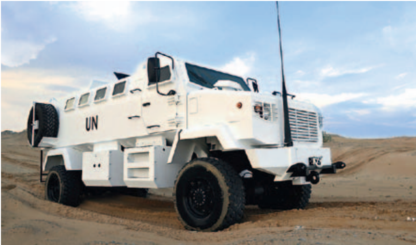
The KrAZ-MPV Shrek One Mounted on the KrAZ-5133HE