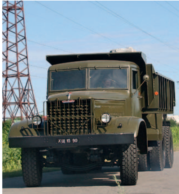
The KrAZ-222 Dniepr Dump Truck Exhibited in "AutoKrAZ" Museum. 2009

The KrAZ-222 truck was in production until July of 1964. The total number of the KrAZ-222 trucks manufactured at the Kremenchug Automobile Plant amounts to 11 641 units. It was succeeded by two dump trucks: the KrAZ-222B and the KrAZ-256.