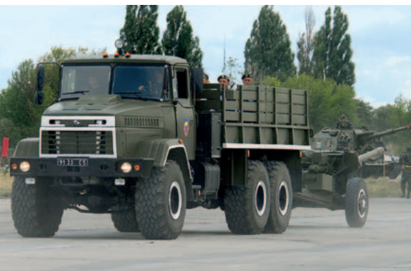
The KrAZ-6322 Soldier AWD Military Vehicle

Today, amid local wars and military conflicts, a need