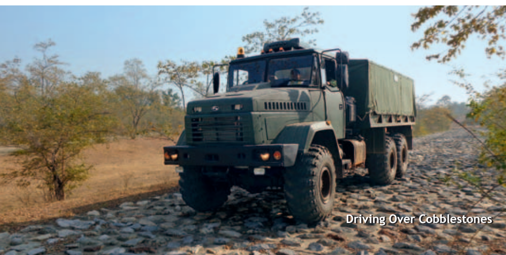
Driving Over Cobblestones

armies of the world. It is evident that in case of victory here, in Southeast Asia, KrAZ will catch on, too.