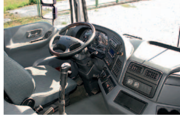
State-of-the-Art Cab Offers High Level of Comfort