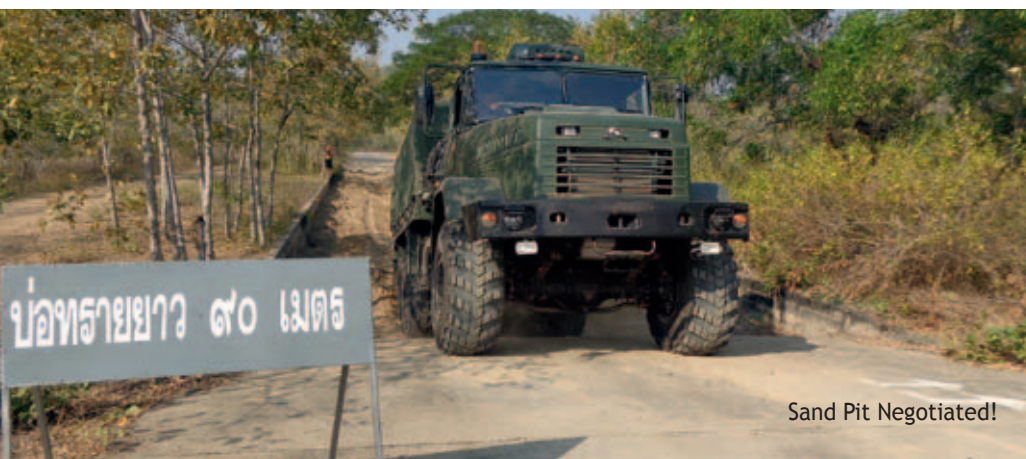
Sand Pit Negotiated!