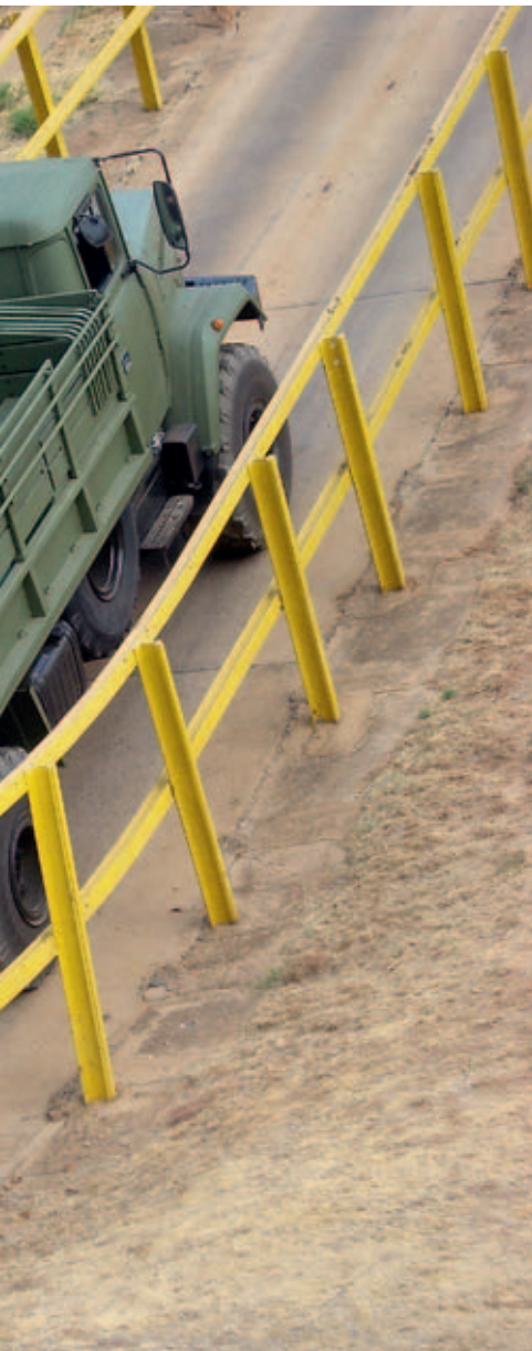
Negotiated 70 Percent Gradient. Africa Aero-