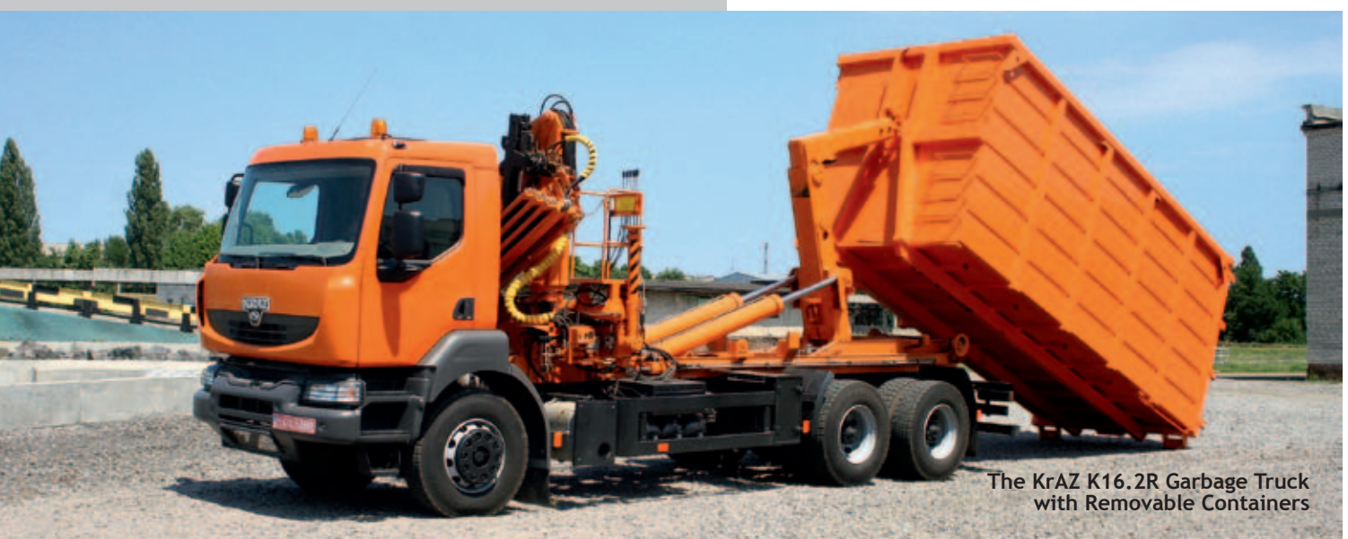
The KrAZ K16.2R Garbage Truck with Removable Containers

“AutoKrAZ” could burst into the market of municipal vehicles by creating the cabover vehicles lineup depriving settled foreign competitors of their competitive advantages. Today the lineup of KrAZ special vehicles contains all the most popular municipal vehicles such as garbage trucks, street sweepers, gully cleaning and sludge pumping