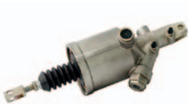
Air-Over Hydraulic Servo Unit 11.1609010