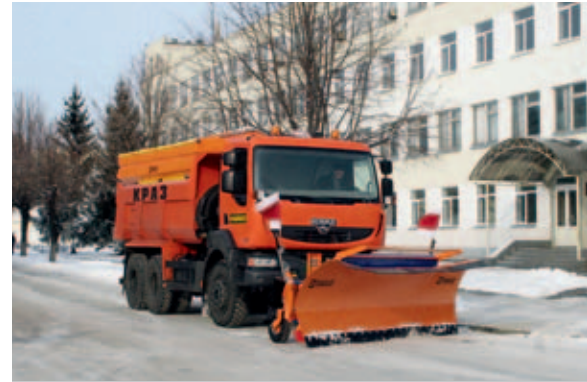
The KrAZ C20.2R Road Maintenance Vehicle with RASCO Salt Spreading and Snow Removal Equipment

PJSC “AutoKrAZ” is open for cooperation. Let’s make cities clean together.