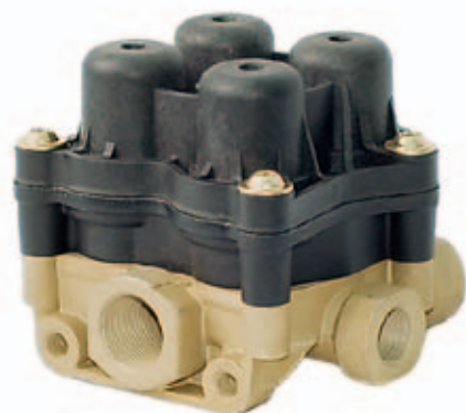
Four-Circuit Protection Valve