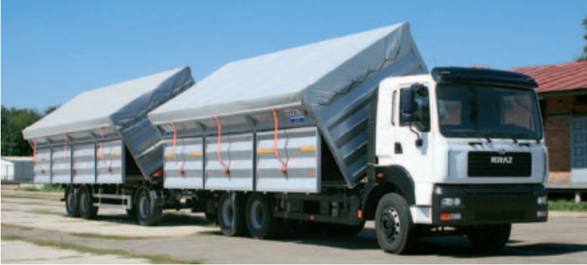
Truck Dump Body Capable to Tip to the Right Side