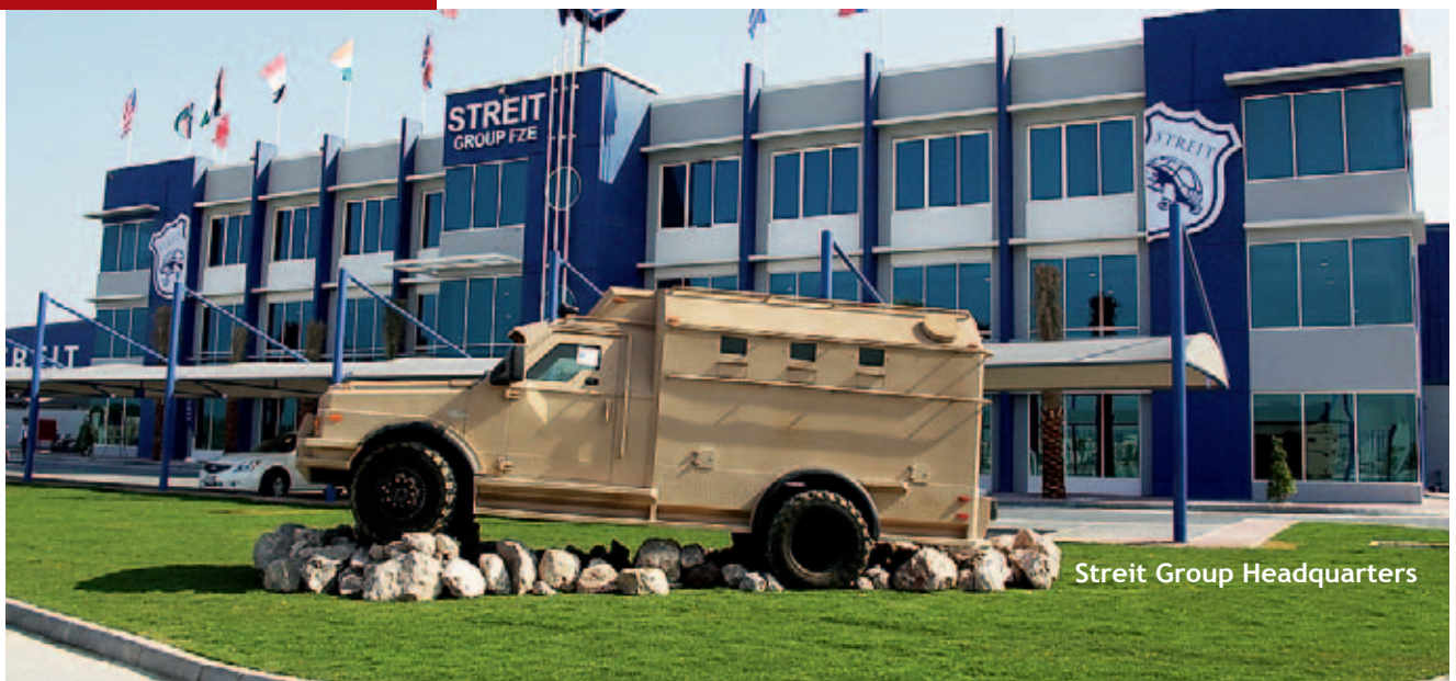
Streit Group Headquarters

time the vehicles produced by Kremenchug Automobile Plant had been widely recognized not only in CIS countries but also in foreign markets. In its turn, Streit was considered as the most acceptable contractor for armored vehicle development due to its flexible approach, the shortest development time and in-house production of prototypes. Thus the first armored vehicle meeting all up-to-date requirements and built by Streit on KrAZ chassis appeared. That was the KrAZ-6322 Raptor 6x6. It was showcased at IDEX-2007 in Abu-Dhabi where it was a great success. In spite of extra 5 tons of armor weight KrAZ masterfully and easily overcame the toughest obstacles of proving ground. I would like to emphasize that KrAZ had been chosen as armored vehicle platform due to its particular reliability and use of time-proven technical solutions. The choice is due in no small part to maintainability