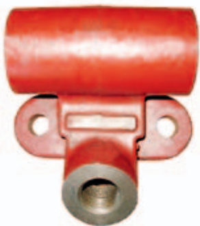
T-Connector 573, 573P