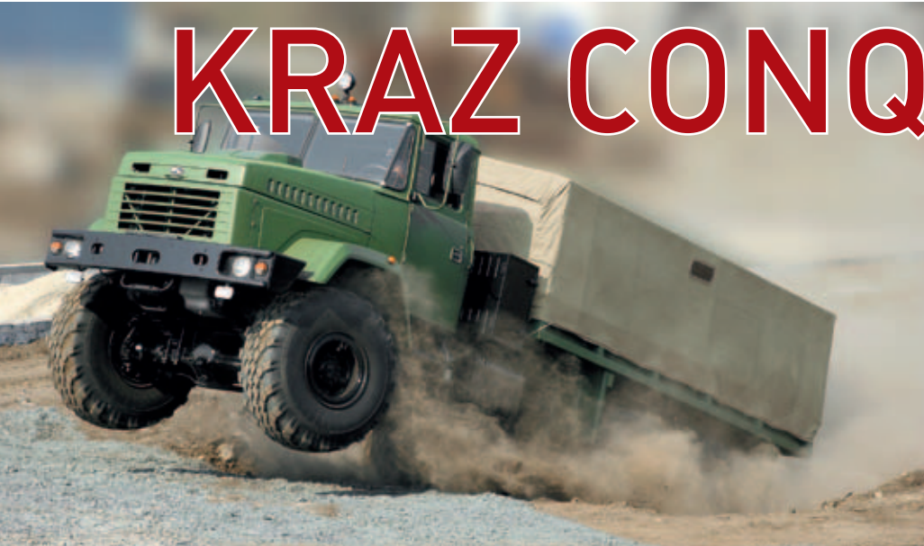
The KrAZ-6322 Three-Axle Truck Jumps Off. Proving Ground at "AutoKraz", 2007.