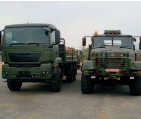
Two Titans KrAZ and MAN on the Start Line!