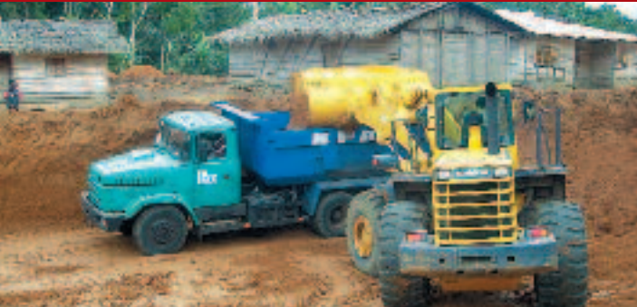
The KrAZ vehicles are involved in the work activity round-the-clock