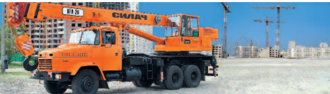
KTA-28 crane truck on the KrAZ-65101 chassis

Leasing term – from 12 to 60 months Advance payment – 20-30% Interest rate – 10-18% per annum