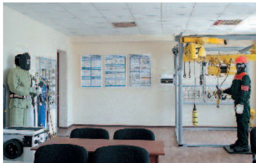
Class of welding, lifting, electric equipment and pressure vessels

Different courses improving a qualification of “AvtoKrAZ” HC specialists are carried out for engineers and technicians in the training class.