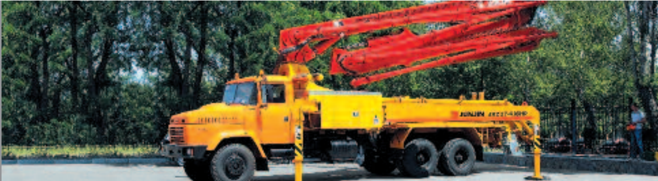
JXZ 37-4.16HP concrete pump on the KrAZ-65053 chassis

The shortest way to Your business success