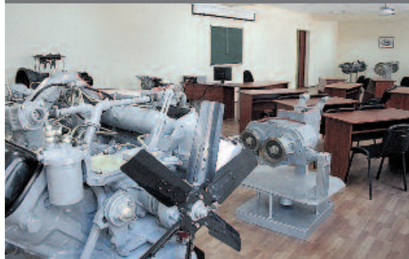
Split units and devices in the automobile class