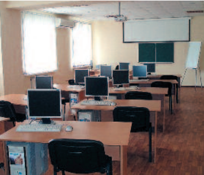
Computer class of the training unit

A new training unit of “AvtoKrAZ” opened its doors. The present unit claims to be the best one in the territory of the former Soviet Union.