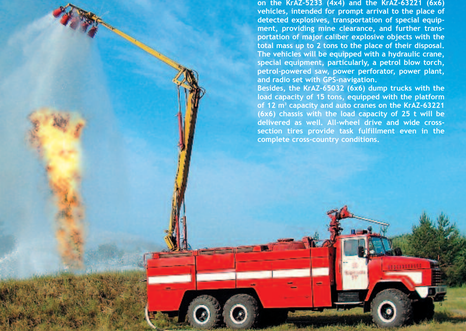
The KrAZ-63221 "Fire-fighter" during the trainings organized by Emergency Situations Ministry of Ukraine

Besides, the KrAZ-65032 (6x6) dump trucks with the load capacity of 15 tons, equipped with the platform of 12 m 3 capacity and auto cranes on the KrAZ-63221 (6x6) chassis with the load capacity of 25 t will be delivered as well. All-wheel drive and wide cross-section tires provide task fulfillment even in the complete cross-country conditions.