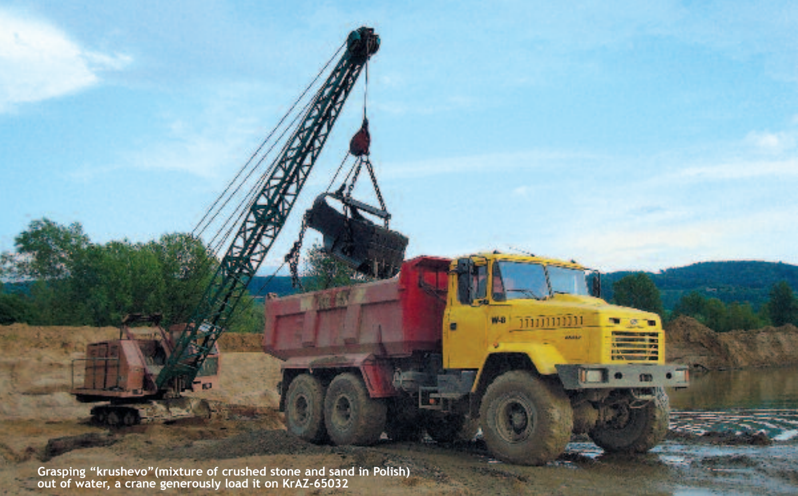
Grasping “krushevo” (mixture of crushed stone and sand in Polish) out of water, a crane generously load it on KrAZ-65032