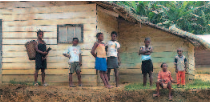
Road construction is a real amusement for local kids