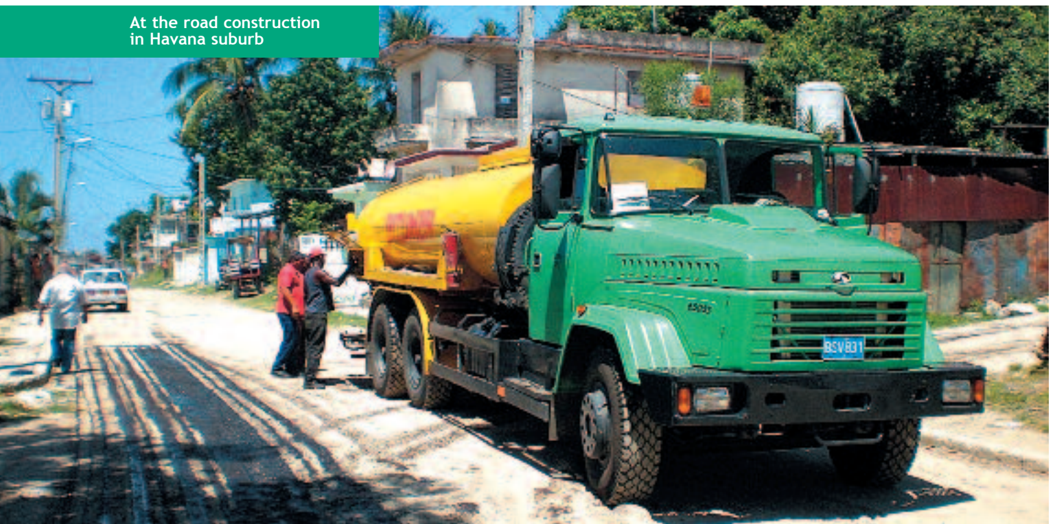
At the road construction in Havana suburb

With the collapse of the USSR and breakup of economic ties, the deliveries of the KrAZ vehicles to the Cuban market were suspended.