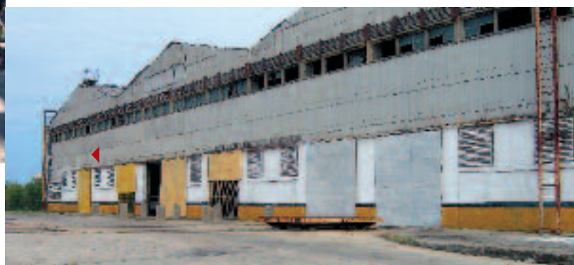
A future enterprise for the KrAZ vehicles modernization in the town of Cienfuegos