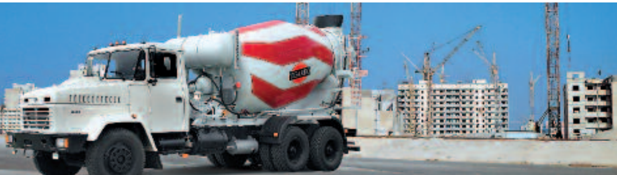
KrAZ-6333P4 motor-truck concrete mixer