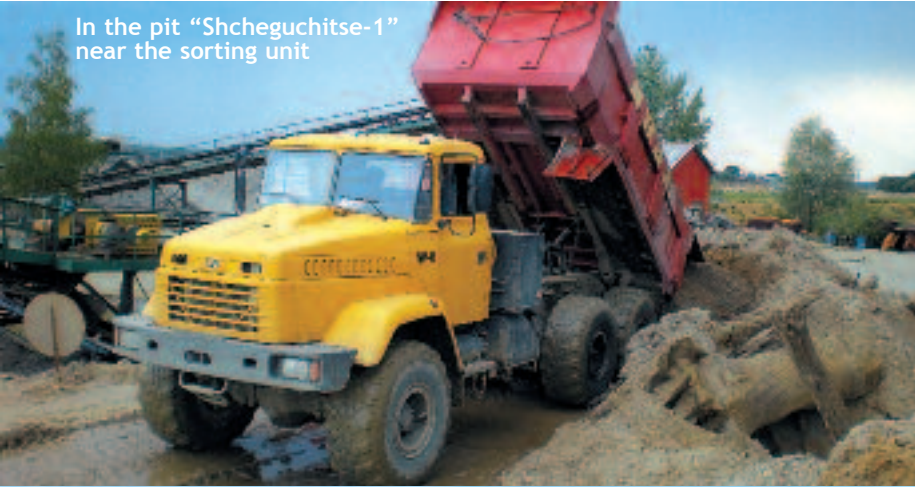
In the pit “Shcheguchitse-1” near the sorting unit