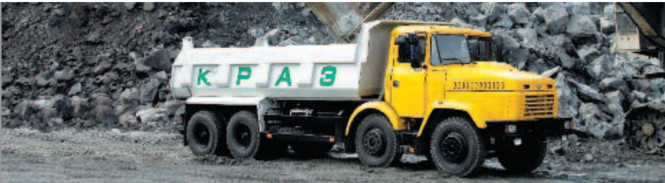
KrAZ-7133C4-021 dump truck