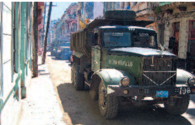
A string of KrAZ municipal old-timers removing construction waste in the center of Havana