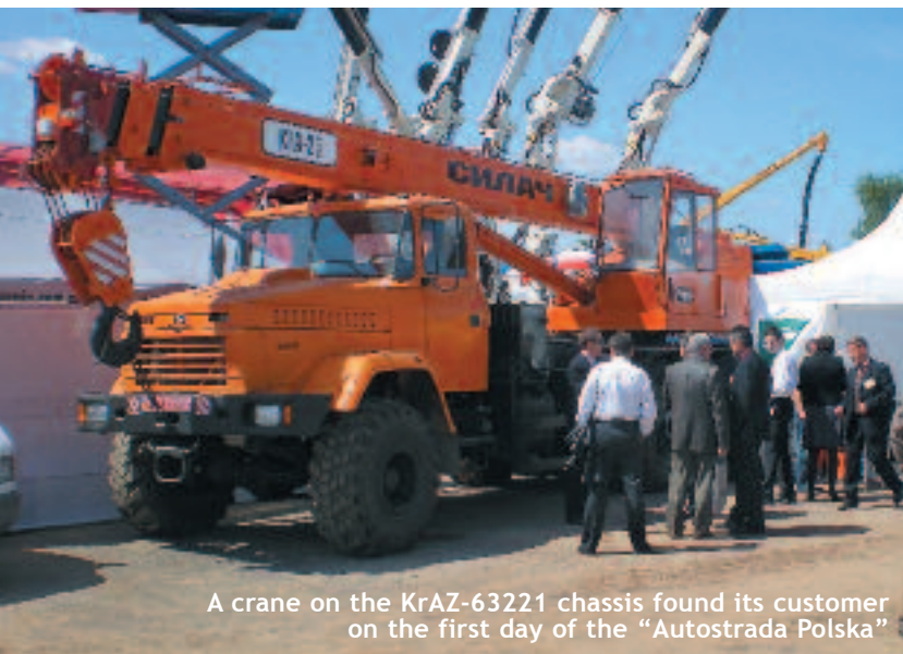
A crane on the KRAZ-63221 chassis found its customer on the first day of the “Autostrada Polska”

“AvtoKRAZ” Holding Company in cooperation with its partner “Autokraz Polska” – company’s exclusive representative in the territory of Poland – represented its products at the “Autostrada Polska 2008, the 14 th International fair of equipment and technology in road construction” (Kielce, Poland).