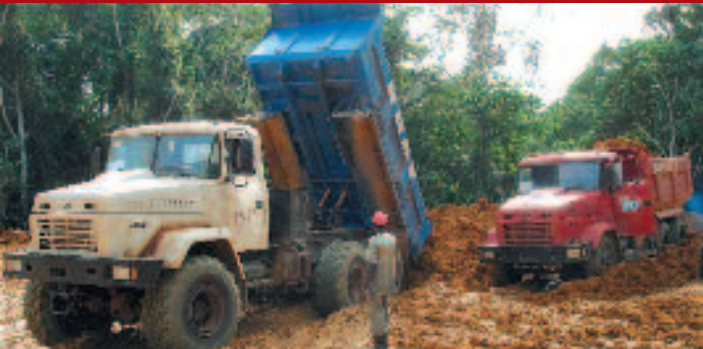
To take out the heavy soil in the extreme conditions is not a difficult task for the KrAZ trucks!