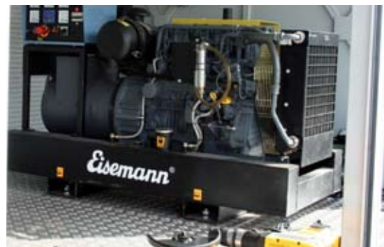
STATIONARY ELECTRIC POWER PLANT