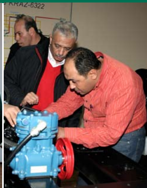
Egyptian MoD officers study KrAZ compressor

different countries of the world, enthusiastically say that vehicle design study is simple and easy to do; this is more like a game now.