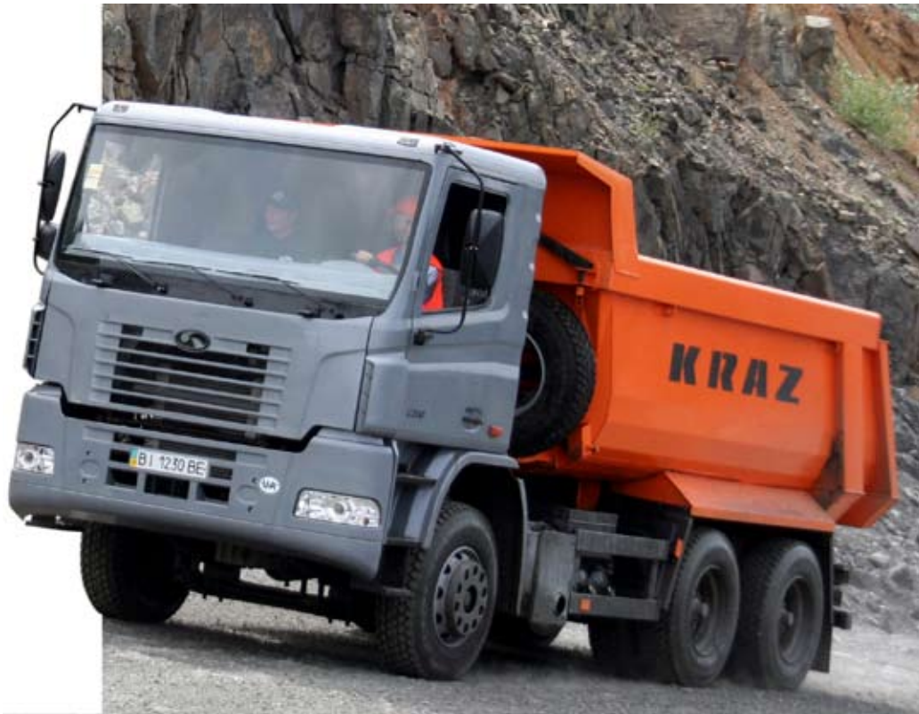
The KrAZ C20.0 dump truck on pit road. 10 percent slope

Poltava Mining and Processing Integrated Works' look is so impressive! Pit dimensions strike not so much as working area that resembles a town. To get to a working face where ore is extracted, you have to drive for a long time past crushing and processing plants where ore is crushed and processed, past repair facilities, parking area for rock haulers and freight yards, as railroad vehicles operate in open pit on a par with motor vehicles. Figures do not so much clearly demonstrate the open pit size (depth is 300 m) as visual interpretation: an electric locomotive pulling a string of dump cars on the opposite side looks like a narrow grey strip barely perceptible on the horizon. 120-tons BELAZ and Komatsu trucks are hardly discerned on the pit bottom.