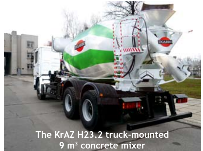
The KrAZ H23.2 truck-mounted 9 m 3 concrete mixer