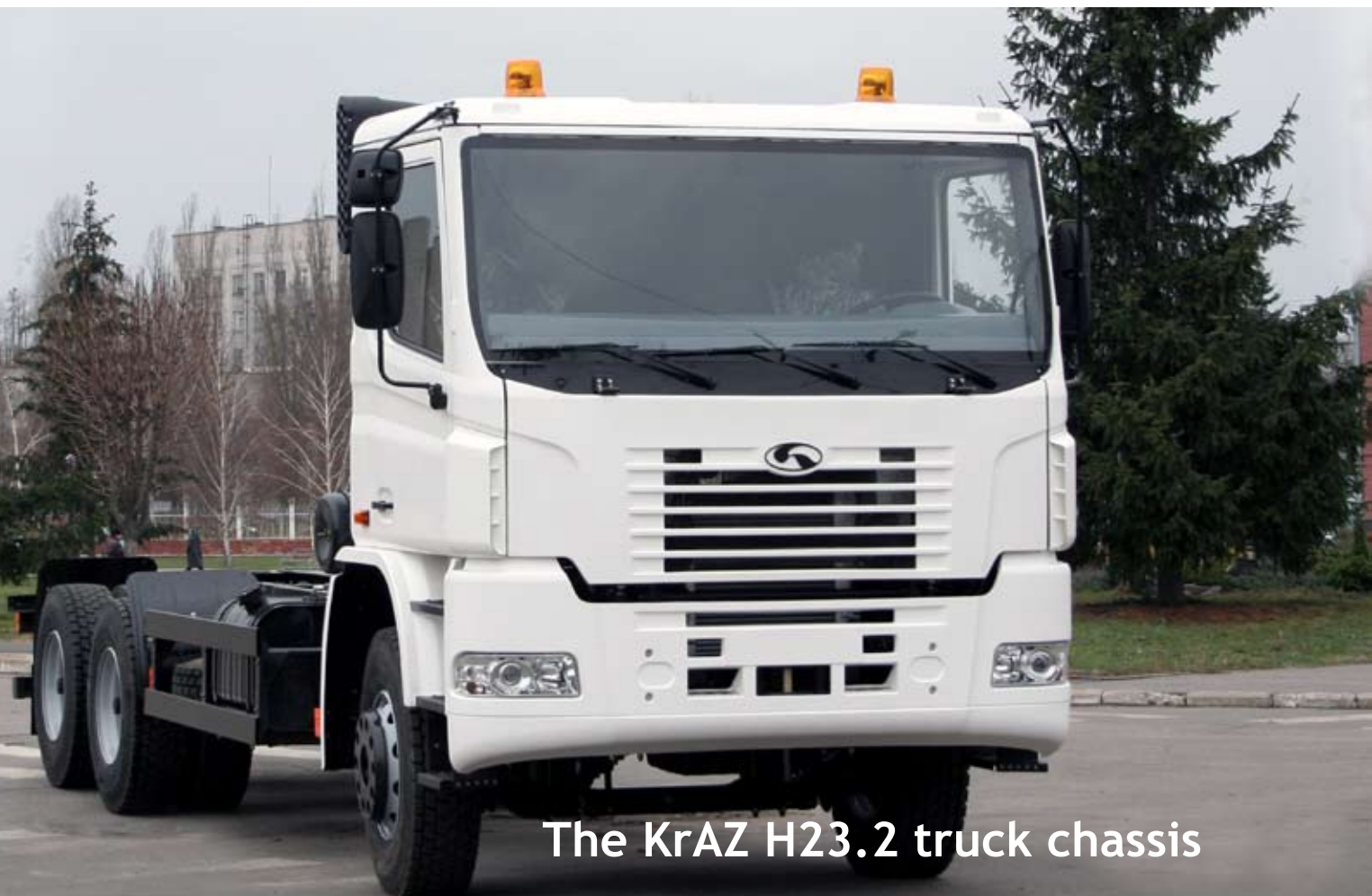
The KrAZ H23.2 truck chassis