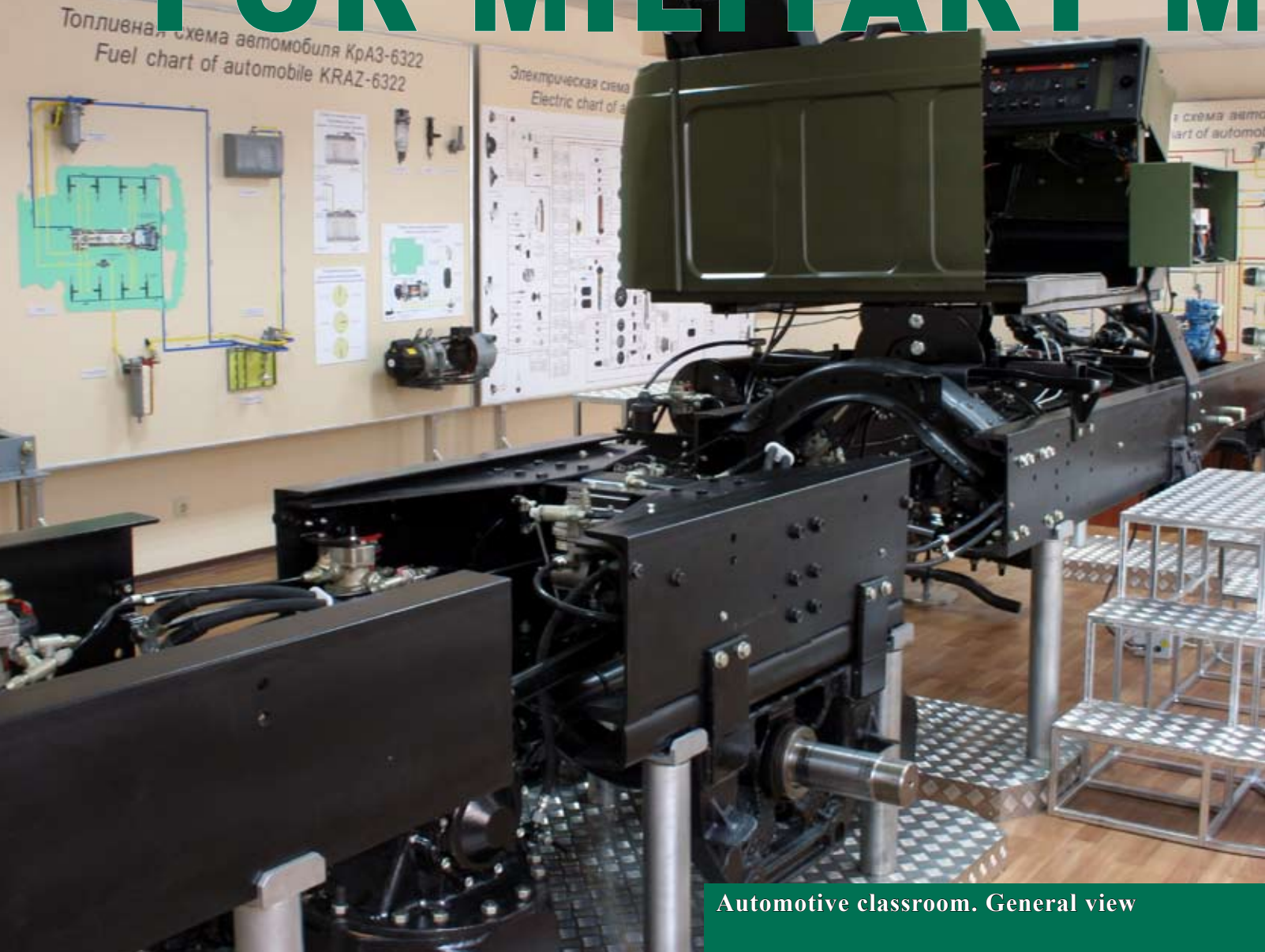
Automotive classroom. General view

One more classroom has been added to “AvtoKRAZ”’s training centre opened in 2008.