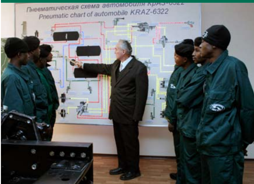
Over 150 trainees from different countries of the world completed their courses in this classroom in 2010