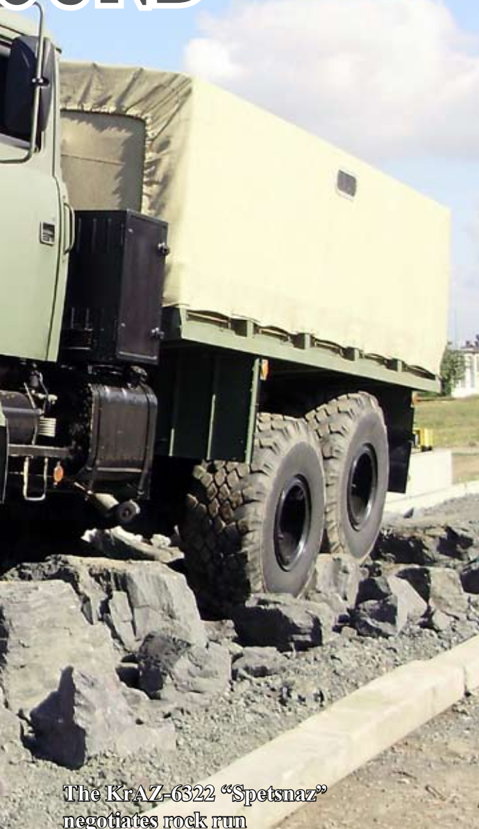
The KrAZ-6322 "Spetsnaz" negotiates rock run

military men can enjoy watching various vehicles to negotiate obstacles whilst sitting in comfortable viewing stand.