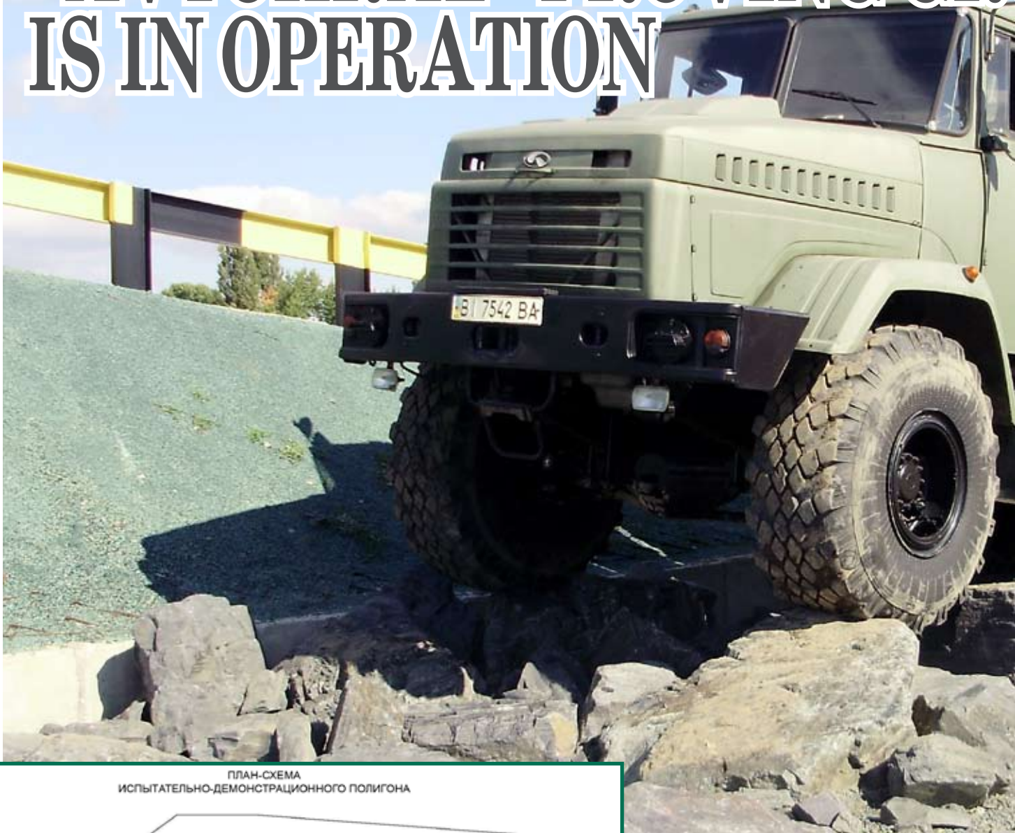
ПЛАН-СХЕМА ИСПЫТАТЕЛЬНО-ДЕМОНСТРАЦИОННОГО ПОЛИГОНА