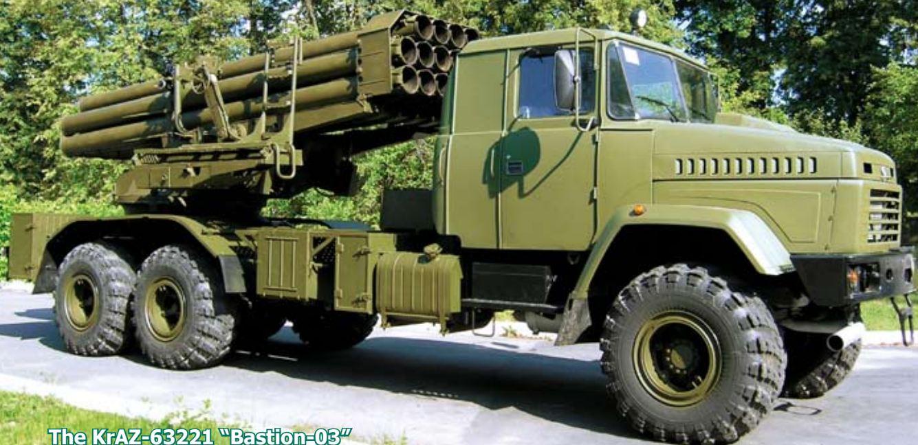
The KrAZ-63221 "Bastion-03"

In 2010, "AvtoKrAZ" jointly with Ukrainian defense plant mounted the MLRS 9K57 "Uragan" on the KrAZ-63221 chassis.