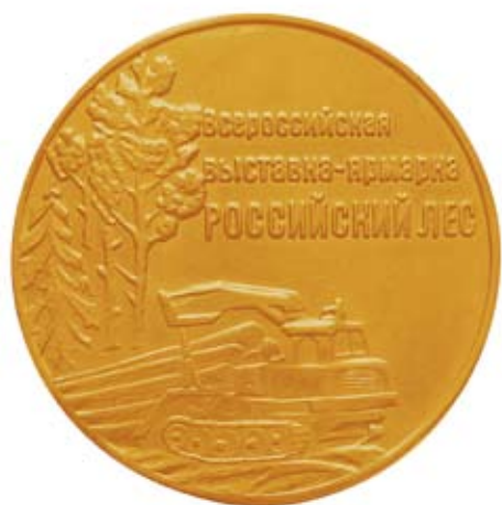
AvtoKrAZ's gold medal. The 1 st place at "Russian Forest-2007" exhibition

Quality and high performance of the KrAZ timber trucks is proved by bronze, silver and gold medals awarded at Russian Forest exhibition in Vologda.