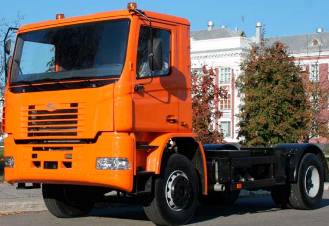
The KrAZ H12.0 truck chassis

“AvtoKrAZ” is constantly expanding its lineup of cabover trucks. The KrAZ C20.2 dump truck 6x4 has been succeeded by two truck chassis: the two-axle KrAZ H12.2 4x2 and the three-axle KrAZ H23.2 6x4.