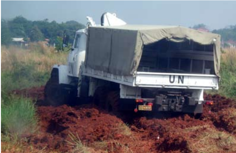
Practical training – off road driving. 2008