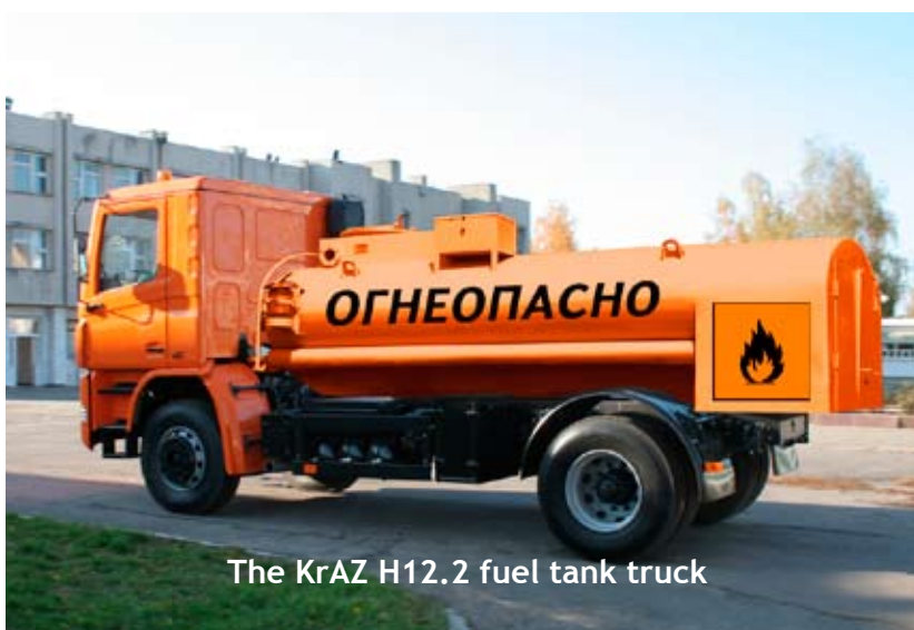
The KrAZ H12.2 fuel tank truck

The vehicle cab of frame and panel type consists of steel frame and fiberglass panels, has ergonomically designed dashboard and seat, height and reach adjustable steering column, climate control system.