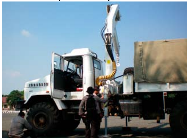
The KrAZ-6322 training workshop truck