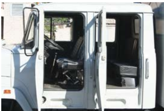
FOUR-DOOR SEVEN-SEAT CAB

of rescue equipment, including stationary and portable electric power plants, hydraulic power unit, set of hydraulic equipment, self-contained water pump, welding equipment, mine rescue equipment and diving system, acid resistant clothing, 8-seat motor boat, Hiab load-handling system.