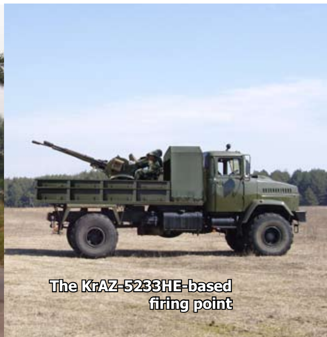
The KrAZ-5233HE-based firing point