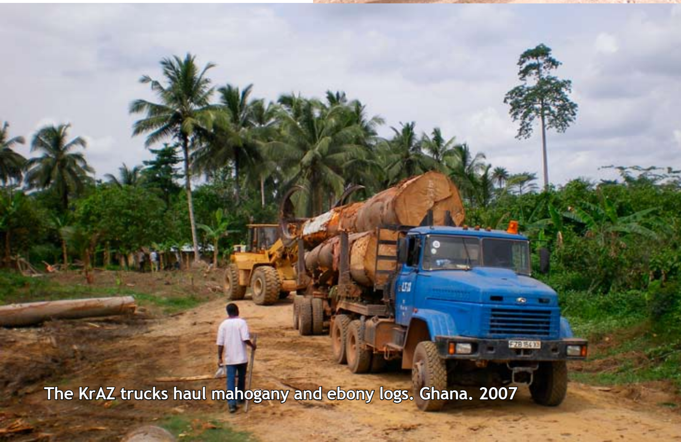
The KrAZ trucks haul mahogany and ebony logs. Ghana. 2007