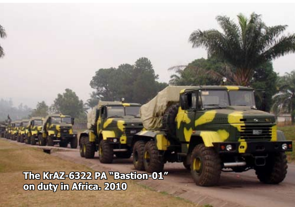
The KrAZ-6322 PA "Bastion-01" on duty in Africa. 2010

KrAZ-63221PA "Bastion-03" vehicles that carry multiple launch rocket system 9K57 "Uragan" (see page 8), special vehicles that serve as a base for mounting EW systems.