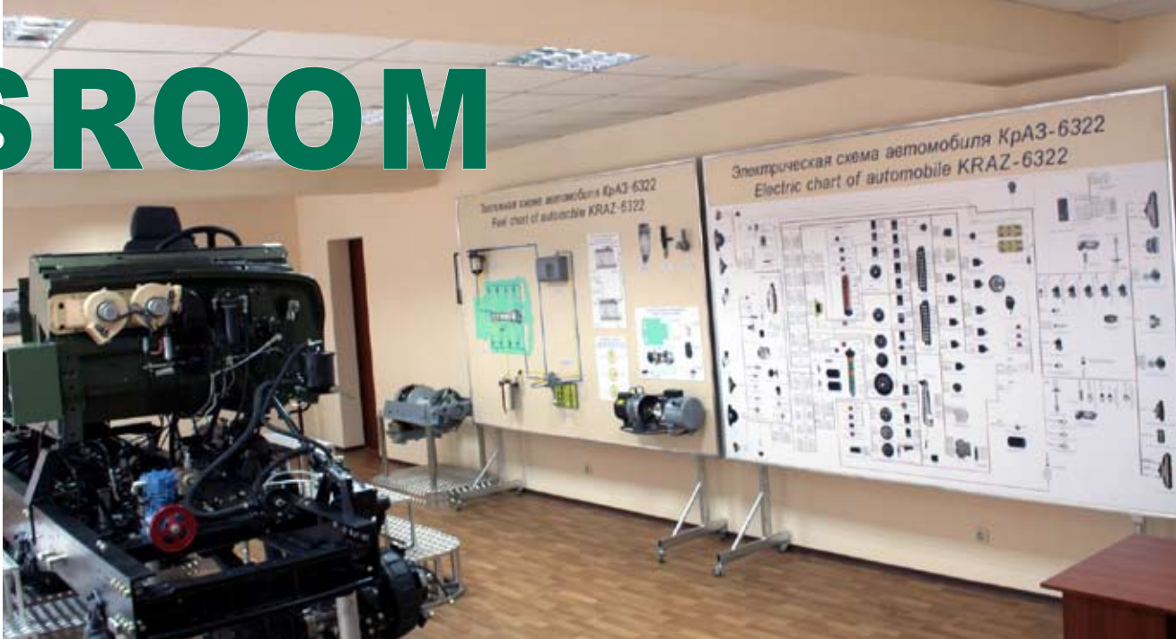
Training displays of various KrAZ systems