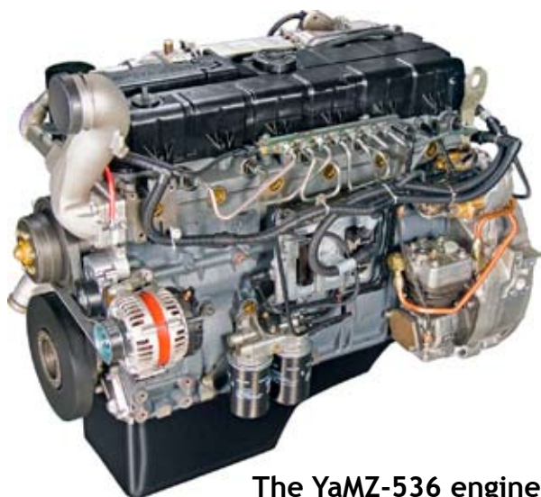
The YaMZ-536 engine

The cabover design allows accommodating a wide choice of power units with both in-line and V-engines.