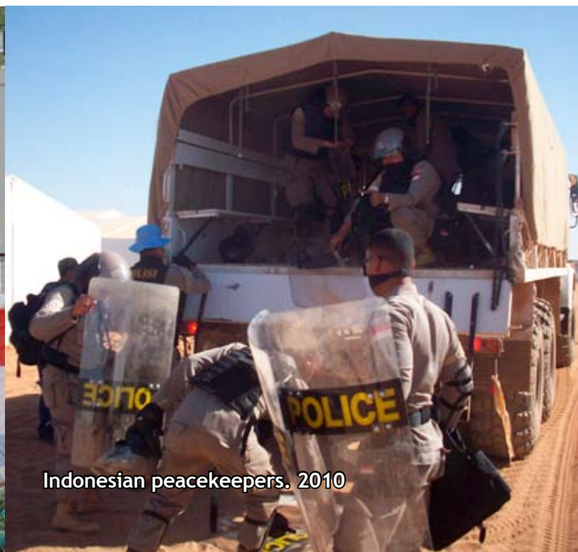
Indonesian peacekeepers. 2010