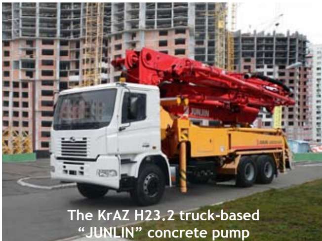
The KrAZ H23.2 truck-based "JUNLIN" concrete pump

The KrAZ H23.2 pilot model is supposed to be fitted with a refuse body provided with Multilift hooklift system and PALFINGER PK 11001 handling system, hopper capacity up to 30 m 3 .