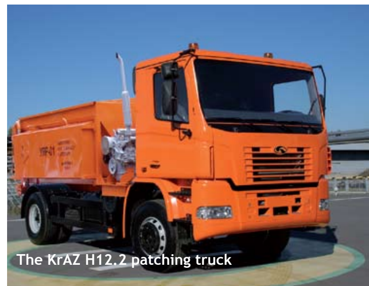
The KrAZ H12.2 patching truck