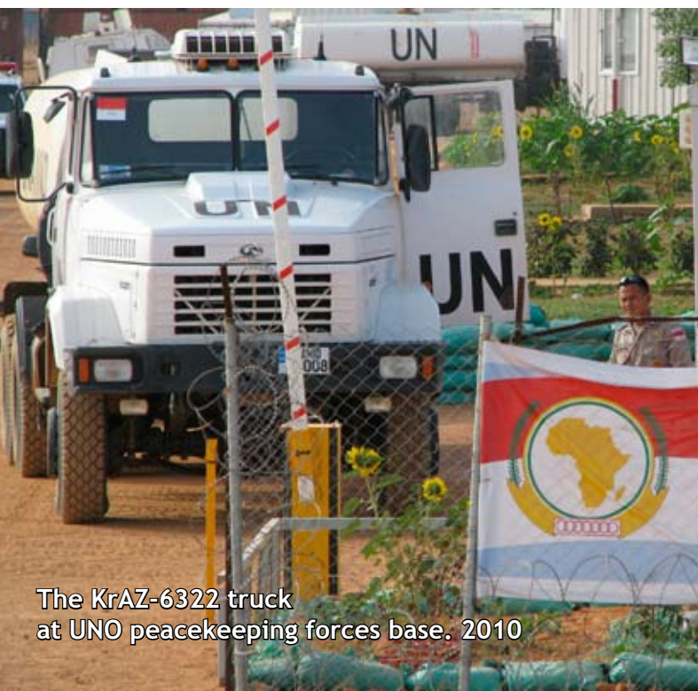
The KrAZ-6322 truck at UNO peacekeeping forces base. 2010

ambassador of Indonesia to Ukraine Mrs. Nining Suningsih Rochadiat. During her visit she said, “AvtoKrAZ” is the only Ukrainian company operating in the Indonesian market. Considering the faultless and trouble-free operation of the KrAZ trucks delivered for the police and peace-keeping forces in 2008, we are very optimistic about future prospects.”