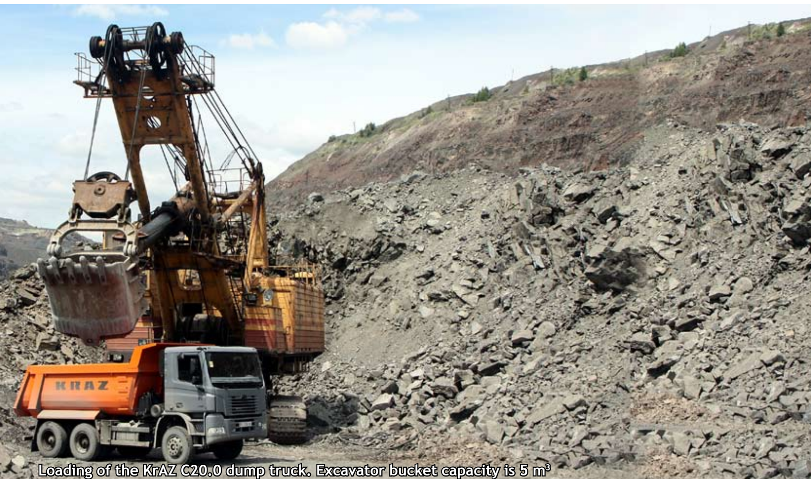
Loading of the KrAZ C20.0 dump truck. Excavator bucket capacity is 5 m 3

Poltava Mining and Processing Integrated Works were put into operation in 1970 under name Dneprovskiy Mining and Processing Integrated Works. Today it is the largest producer and exporter of iron-ore pellets in iron and steel industries. Location near Komsomolsk, 109 km far from Poltava. (Gruzovik Press, No. 11, 2010)