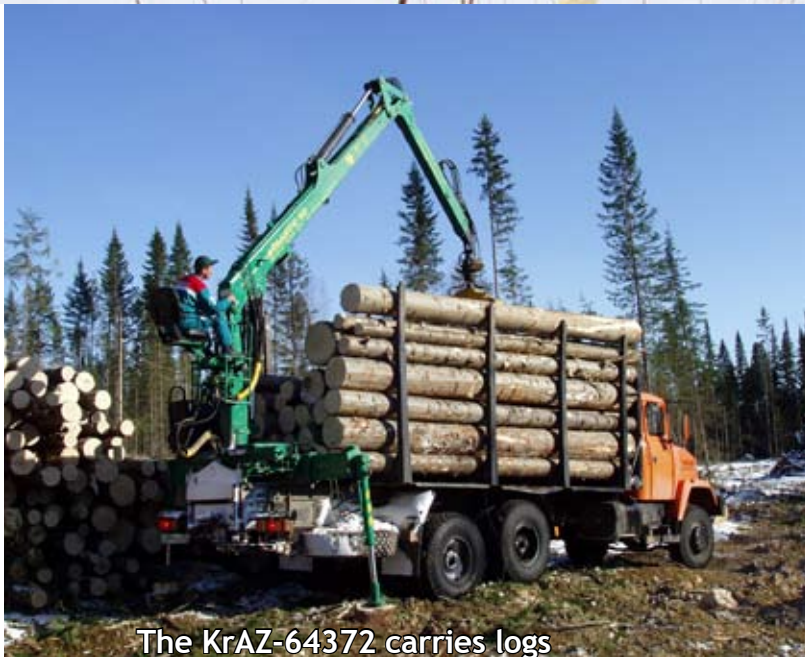
The KrAZ-64372 carries logs in a Krasnoyarsk forestry