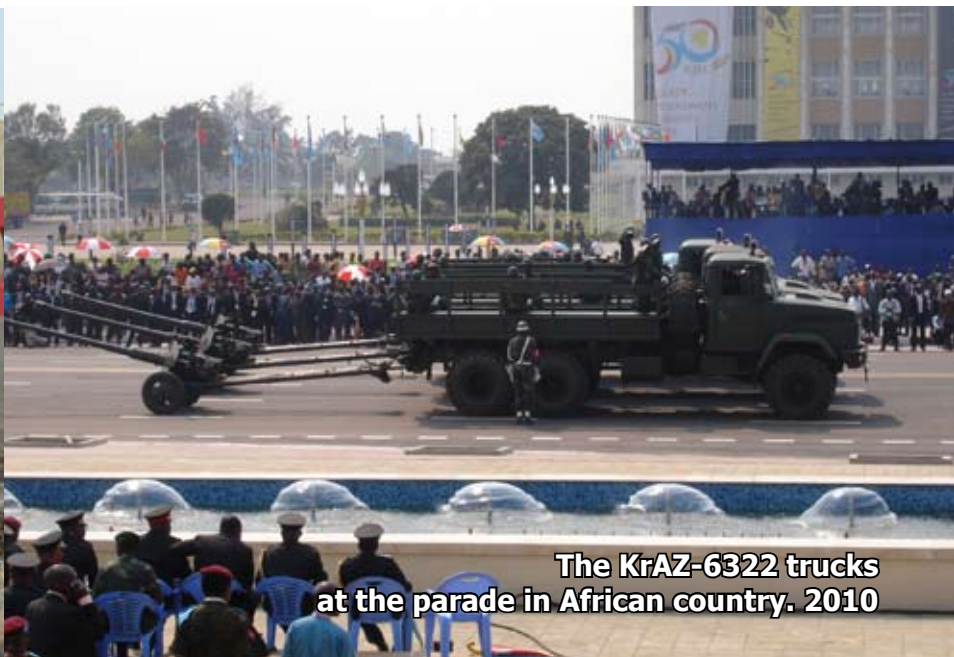
The KrAZ-6322 trucks at the parade in African country. 2010