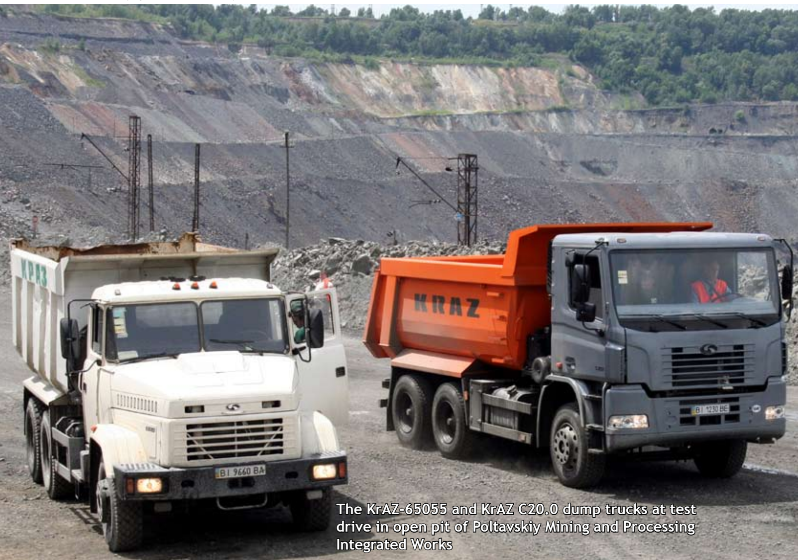
The KrAZ-65055 and KrAZ C20.0 dump trucks at test drive in open pit of Poltavskiy Mining and Processing Integrated Works

The road test took place in an open pit of Poltavskiy Mining and Processing Integrated Works. We had at our disposal a standard KrAZ-65055 dump truck just to compare it with the cabover. 15 t of ballast weight was added to each vehicle. Unused roadways with turning circles and slopes of up to 8 percent were chosen as a road track by mining survivors. This allowed us to appreciate the cabover advantages over its predecessor.