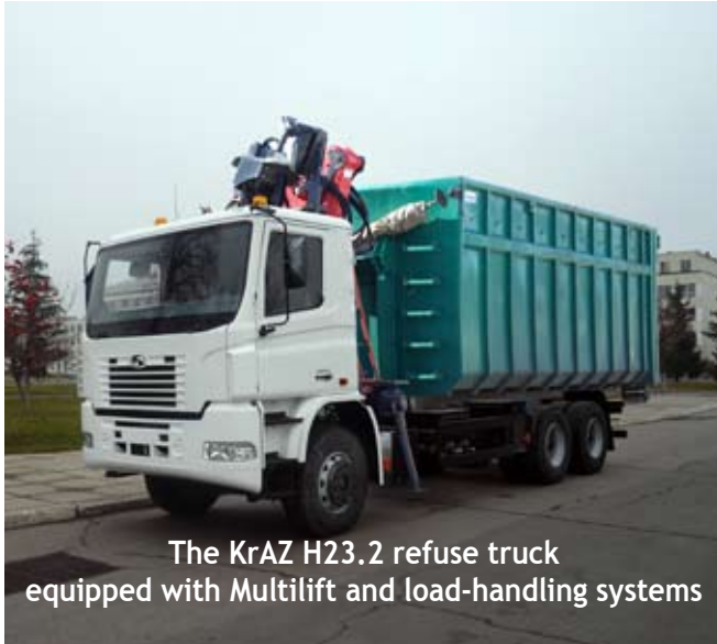
The KrAZ H23.2 refuse truck equipped with Multilift and load-handling systems

introduced at 8th edition of KommunTech 2010 held in November in Kiev.