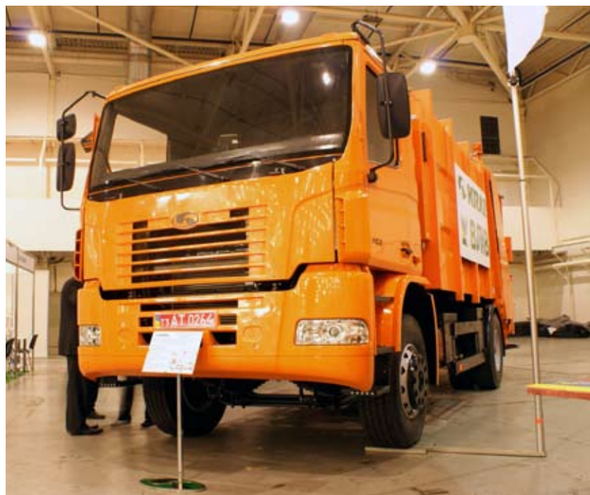
The KrAZ H12.2 refuse truck at KommunTech 2010

features extended springs attached through bolt and eye that are equipped with anti-roll bar. Mounted on the first KrAZ H12.2 truck chassis was a rear loader refuse body (120-1100 l containers) with 17m 3 hopper.