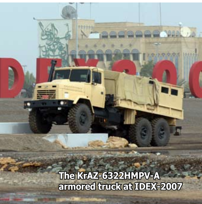
The KrAZ-6322HMPV-A armored truck at IDEX-2007

mostly lies at the heart of interest of military men. They meet all Army requirements for soldiers: strong, rugged, reliable and