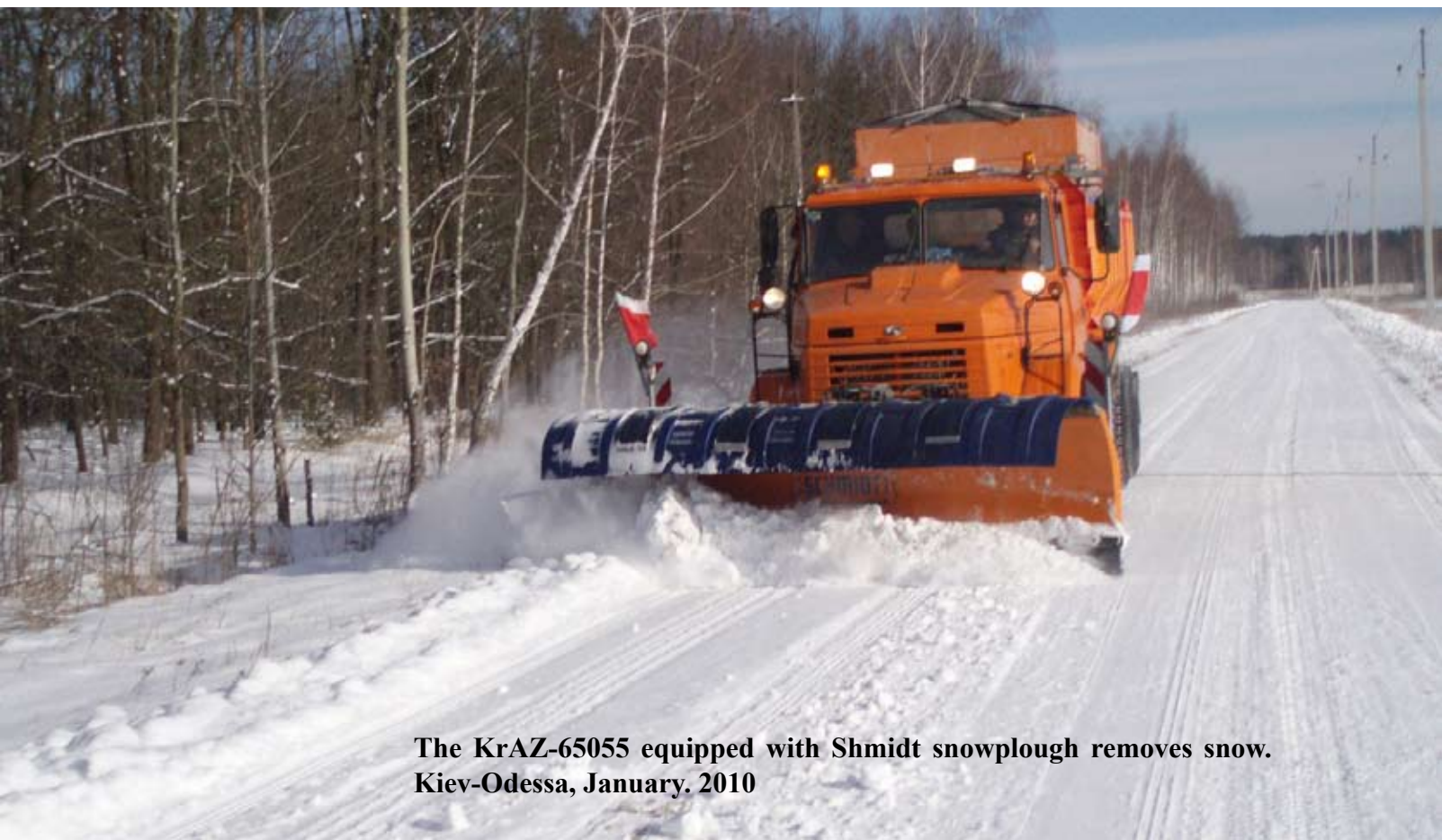
The KrAZ-65055 equipped with Shmidt snowplough removes snow. Kiev-Odessa, January. 2010

Operators at regional road departments emphasize the necessity to provide their fleets with more efficient national vehicles. In fact, current demand for such vehicles comes to thousands of units.