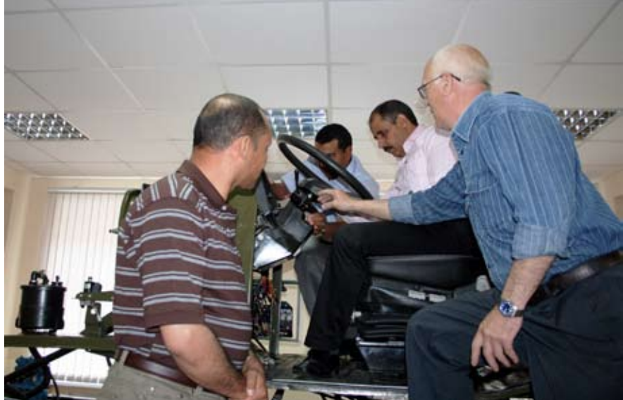
Foreign trainees examine the dashboard

Previously it took about three months to complete training course that now lasts only 2-3 weeks.